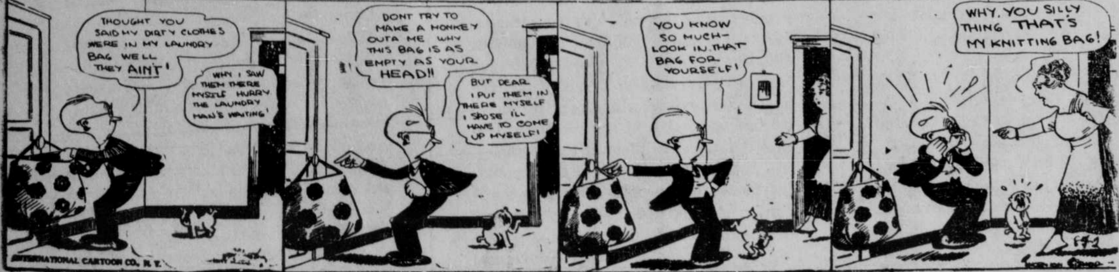
By Thornton Fisher