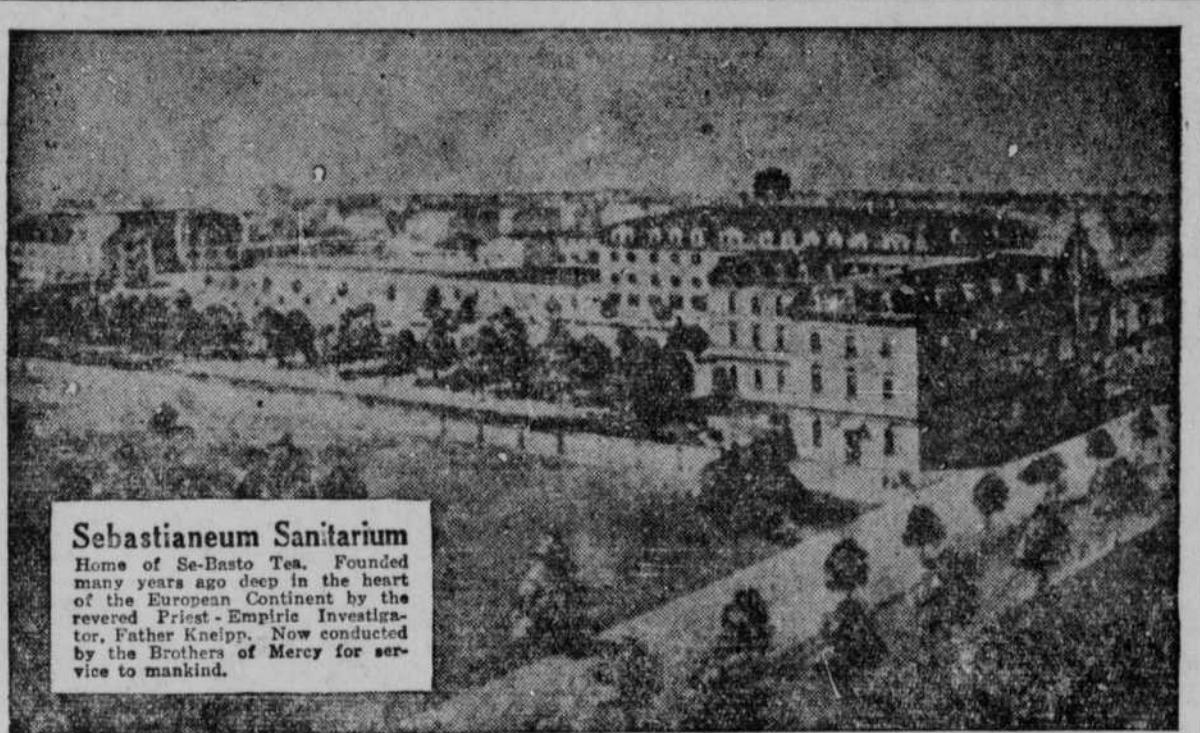
Sebastianeum Sanitarium Home of Se-Basto Tea. Founded many years ago deep in the heart of the European Continent by the revered Priest-Empiric Investigator, Father Kneipp. Now conducted by the Brothers of Mercy for service to mankind.

Mme. C. J. Walker's Glossine, although more than thirty-five years on the market, is still the leader in its field. The reason for this is because it not only serves as a scalp oil, but it gives the hair that silky sheen and natural gloss that is the delight of every woman. Mme. C. J. Walker's Brown Face Powder is not just another Face Powder, but is the result of years of experimenting to produce the perfect blend to impart a velvety softness and at the same time cooling and refreshing. Just the thing for these hot days. The Mme. C. J. Walker's wonderful preparations are sold by Walker Beautyicians and Drug Stores everywhere, or you can write The Mme. C. J. Walker Mfg. Company, direct Address: The Walker Building, Indianapolis, Indiana.