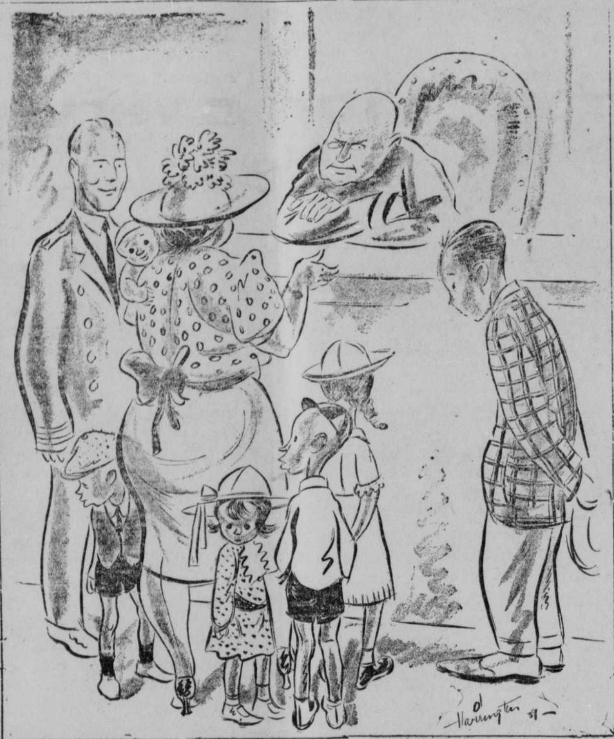
I been goin' wid Mr. Stewmeat for fifteen years an' I think it's 'bout time he did the right thing by me.