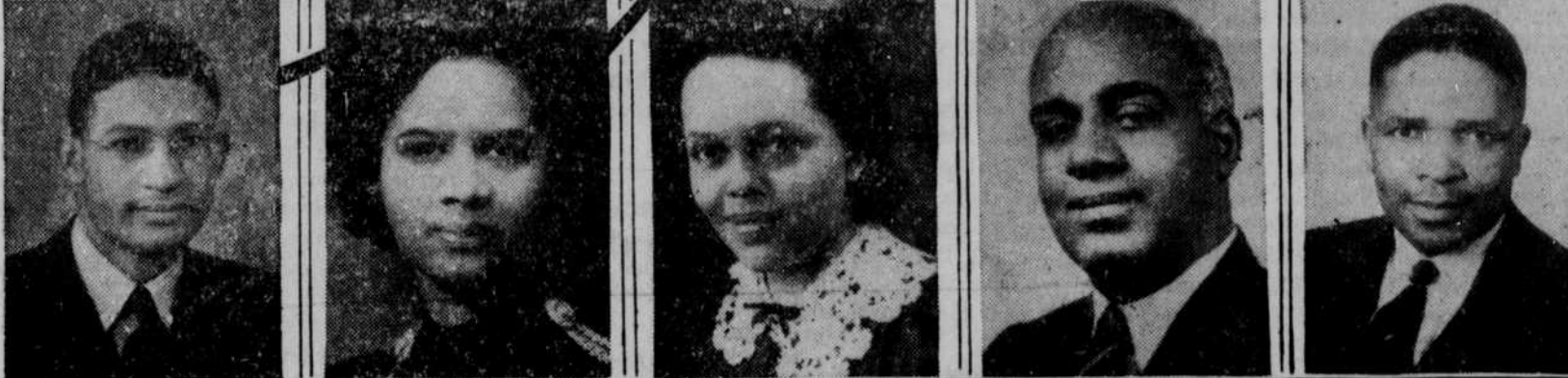
Little Rock, Ark. Houston, Tex. Chicago, Ill. Lexington, Ky. Tampa, Fla. South Africa