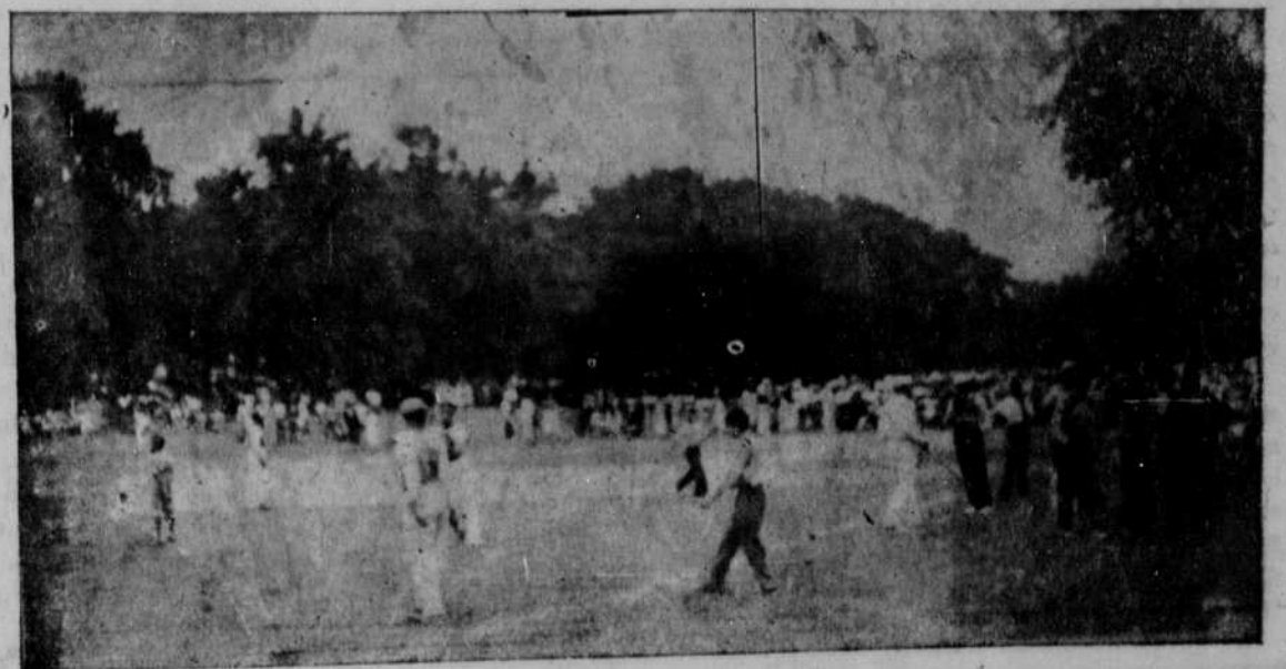
THOUSANDS ATTEND SUNDAY SCHOOL PICNIC AT ELMWOOD