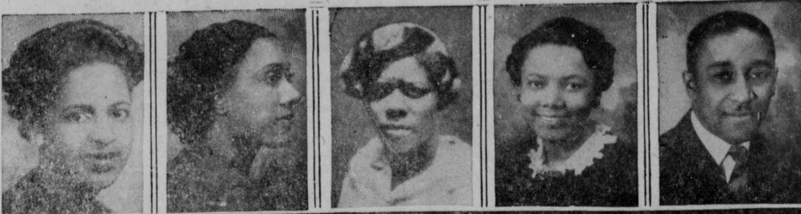
Oklahoma City Minneapolis Toronto, Canada Canton, O. Charlotte, N.C.

12 OF THE 35 SOCIAL WORK PLACEMENTS MADE OF ATLANTA U. SCHOOL OF SOCIAL WORK GRADUATES DURING THE PAST YEAR