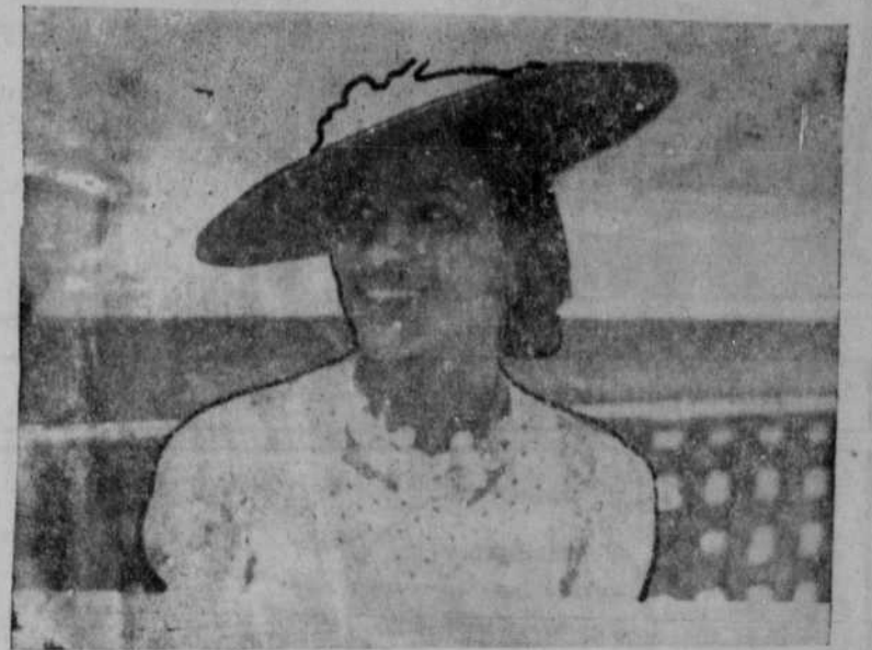
Photographed in her new Sunday Hat.