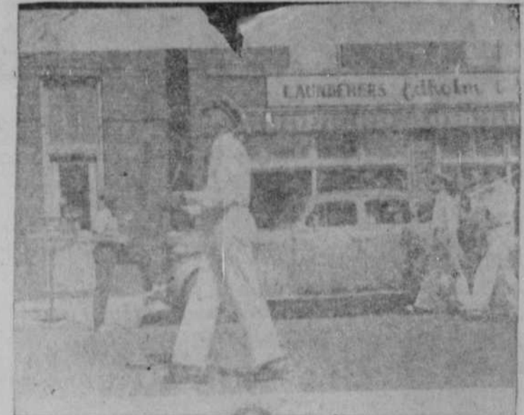
Maxwell Butcher is shown leading Omaha band in Elks parade