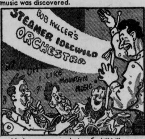
He began to popularize the hill billy songs, and with the aid of a little orchestra he formed, made many recordings, including numbers of his own composition.