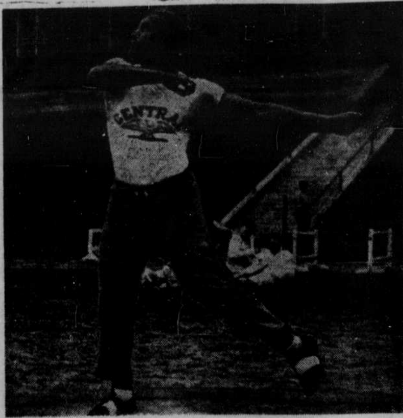
CENTRAL TRACK STAR COPS TWO FIRST IN INVITATIONAL MEET

University Invitational Track Meet at Tech Saturday, when he leaped 20 feet 9 three-fourths inches. This is the jump that netted the new mark. Look at the expression on Bridges face.