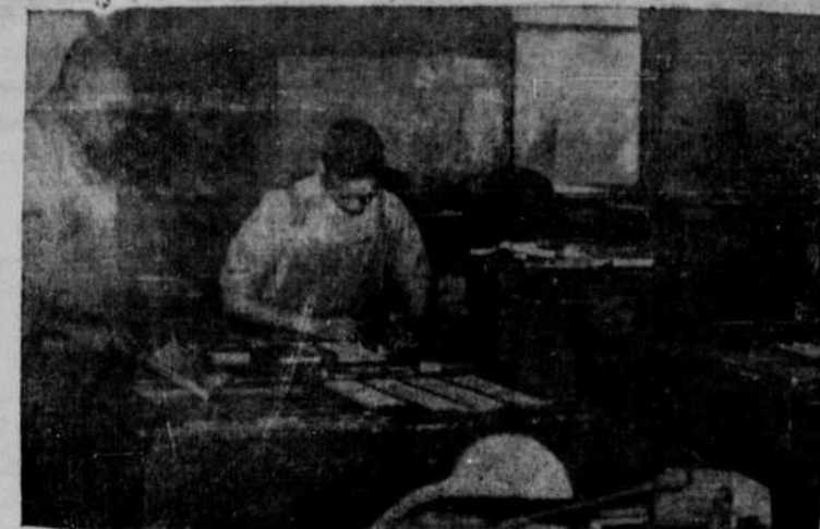
Section Composing Room

To furnish honest and honorable employment to young Colored citizens trained to follow the vocations of printing and journalism. To afford a reliable source of advertising for the merchants who sell millions of dollars worth of material to this Negro group each year.