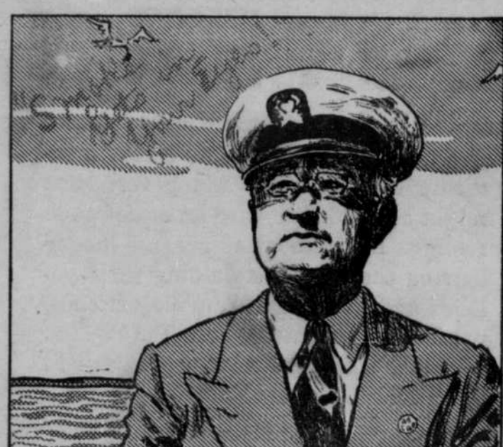
Harbach has never lost his touch. For "Roberta," among other songs, he produced "When Your Heart's On Fire, Smoke Gets In Your Eyes." He is now at work, in his Manhattan, N. Y., home, on at least one new production.