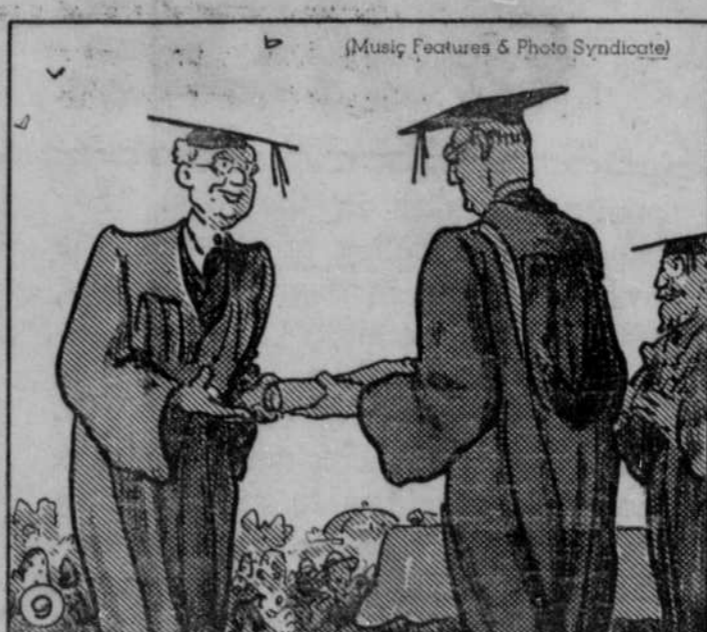
Knox College eventually made him a Doctor of Literature; the number and quality of his productions earned him membership in the American Society of Composers, Authors and Publishers and a place on the Board of Directors.