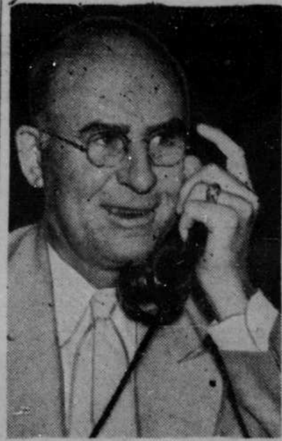
Governor R. L. Cochran . . . from seven to one plurality.