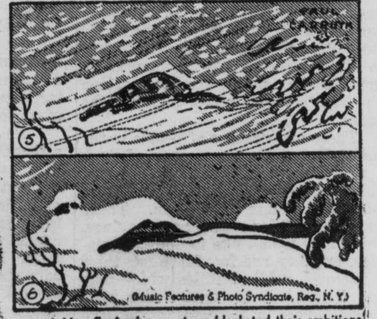
A New England snow storm blanketed their ambitions as well as their cabin.