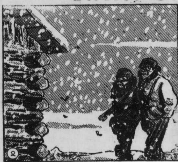
Collaboration in their case meant keeping constant communication.