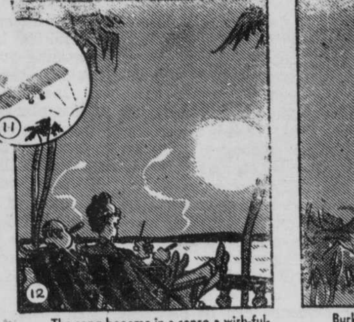
The song became in a sense a wish-fulfillment for them, because in a little while they were looking at the same moon in