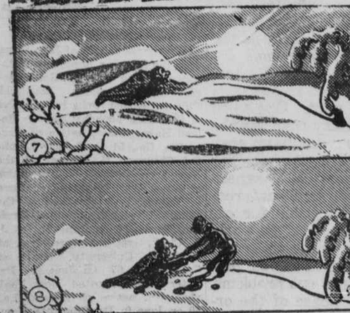
Their ever-present peril banished all thoughts of song-writing from their minds.