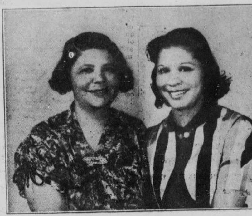
CALIFORNIANS CHARM INSURANCE EXECUTIVES

ends July 2, has instructors physicians from Tulane university and Louisiana State University Medical school in addition to colored doctors. (ANP)