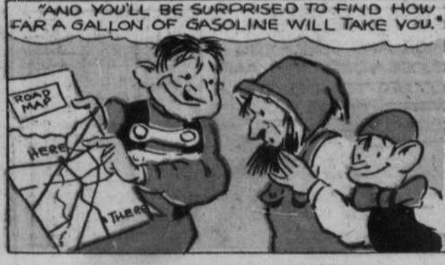
"AND YOU'LL BE SURPRISED TO FIND HOW FAR A GALLON OF GASOLINE WILL TAKE YOU."