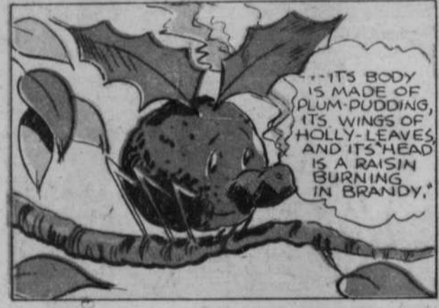
"--ITS BODY IS MADE OF PLUM-PUDDING, ITS WINGS OF HOLLY-LEAVES AND ITS HEAD IS A RAISIN BURNING IN BRANDY."