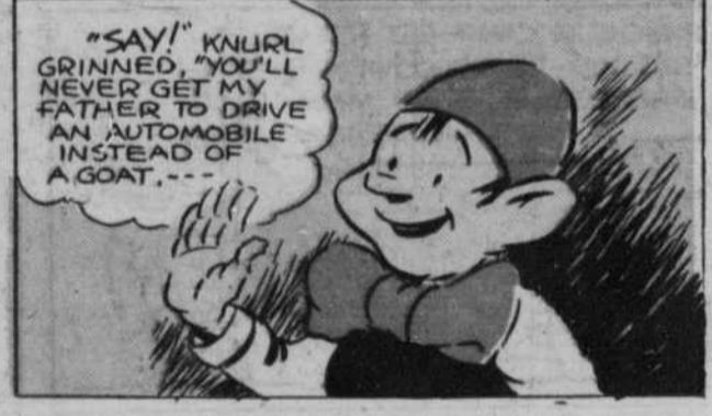
"SAY!" KNURL GRINNED, "YOU'LL NEVER GET MY FATHER TO DRIVE AN AUTOMOBILE INSTEAD OF A GOAT.----