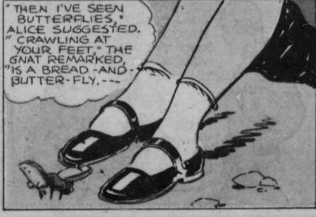
"THEN I'VE SEEN BUTTERFLIES," ALICE SUGGESTED. "CRAWLING AT YOUR FEET," THE GNAT REMARKED, "IS A BREAD-AND-BUTTER-FLY.----