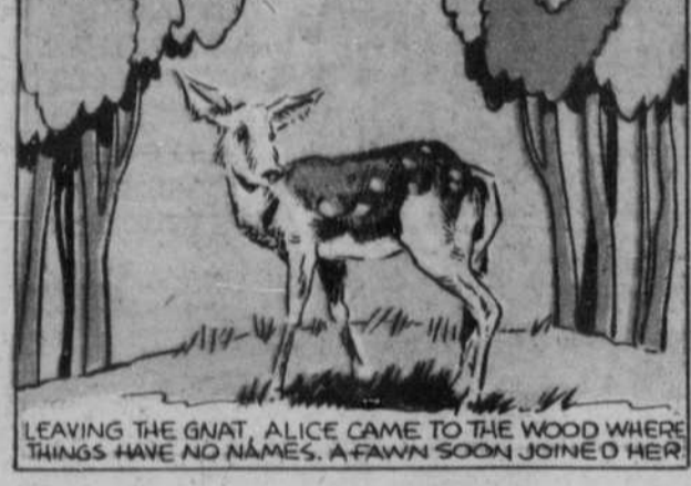
LEAVING THE GNAT, ALICE CAME TO THE WOOD WHERE THINGS HAVE NO NAMES. A FAWN SOON JOINED HER