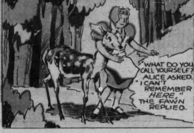
"WHAT DO YOU CALL YOURSELF?" ALICE ASKED. "I CAN'T REMEMBER HERE," THE FAWN REPLIED.