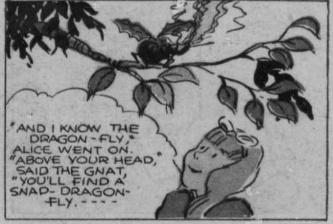
"AND I KNOW THE DRAGON-FLY," ALICE WENT ON. "ABOVE YOUR HEAD," SAID THE GNAT, "YOU'LL FIND A SNAD-DRAGON-FLY.----