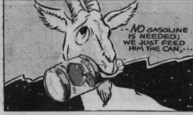
"--NO GASOLINE IS NEEDED; WE JUST FEED HIM THE CAN;--"