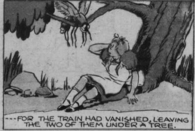
---FOR THE TRAIN HAD VANISHED, LEAVING THE TWO OF THEM UNDER A TREE.