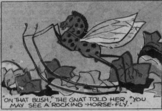
"ON THAT BUSH," THE GNAT TOLD HER "YOU MAY SEE A ROCKING HORSE-FLY."