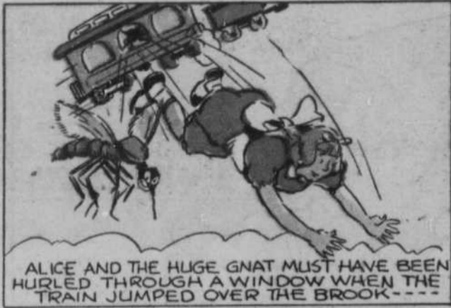
ALICE AND THE HUGE GNAT MUST HAVE BEEN HURLED THROUGH A WINDOW WHEN THE TRAIN JUMPED OVER THE BROOK----