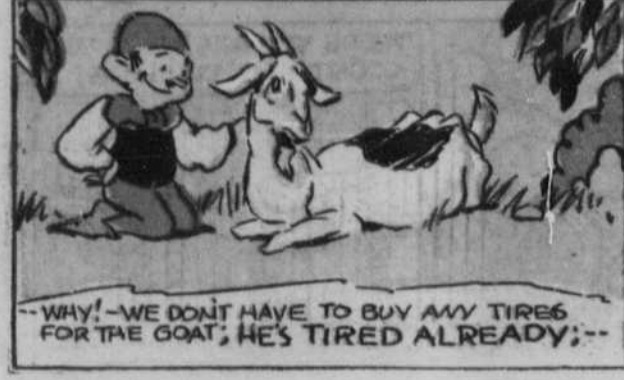
"--WHY!--WE DON'T HAVE TO BUY ANY TIRES FOR THE GOAT; HE'S TIRED ALREADY;--"