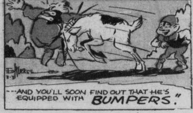
"--AND YOU'LL SOON FIND OUT THAT HE'S EQUIPPED WITH BUMPERS!"