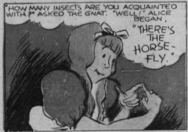
"HOW MANY INSECTS ARE YOU ACQUAINTED WITH?" ASKED THE GNAT. "WELL," ALICE BEGAN, "THERE'S THE HORSE-FLY."