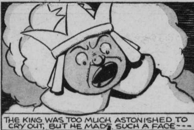
THE KING WAS TOO MUCH ASTONISHED TO CRY OUT, BUT HE MADE SUCH A FACE---