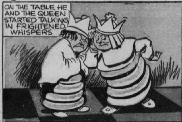
ON THE TABLE HE AND THE QUEEN STARTED TALKING IN FRIGHTENED WHISPERS.