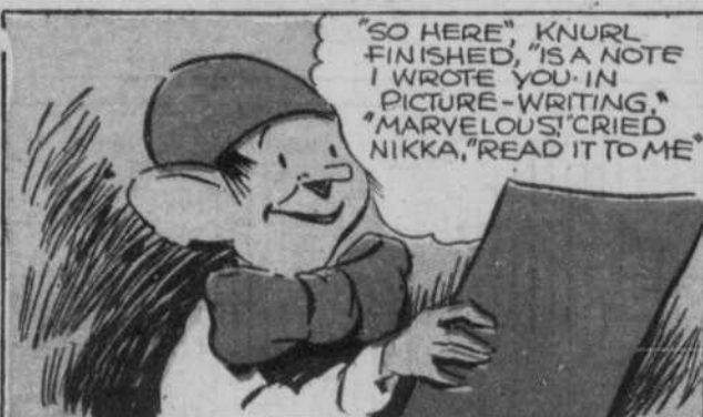
"SO HERE," KNURL FINISHED, "IS A NOTE I WROTE YOU IN PICTURE-WRITING," MARVELOUS! CRIED NIKKA, "READ IT TO ME."