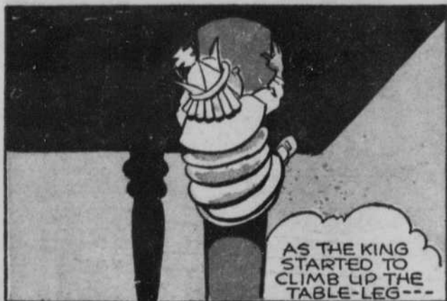
AS THE KING STARTED TO CLIMB UP THE TABLE-LEG---