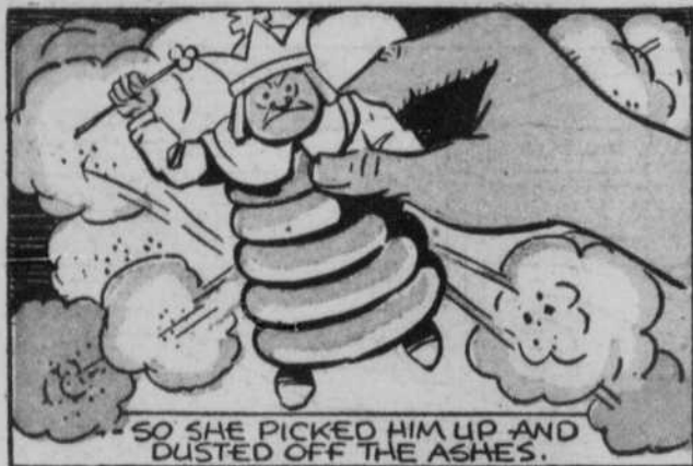
SO SHE PICKED HIM UP AND DUSTED OFF THE ASHES.