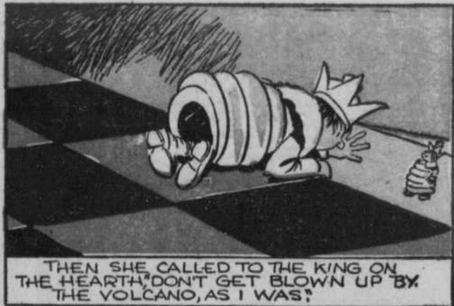
THEN SHE CALLED TO THE KING ON THE HEARTH, "DON'T GET BLOWN UP BY THE VOLCANO, AS I WAS!"