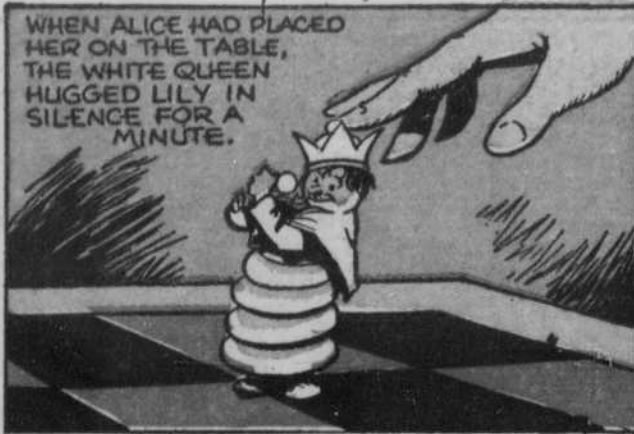
WHEN ALICE HAD PLACED HER ON THE TABLE, THE WHITE QUEEN HUGGED LILY IN SILENCE FOR A MINUTE.