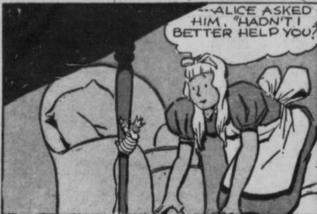
ALICE ASKED HIM, "HADN'T I BETTER HELP YOU?"