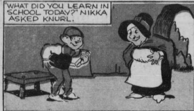
WHAT DID YOU LEARN IN SCHOOL TODAY? NIKKA ASKED KNURL.