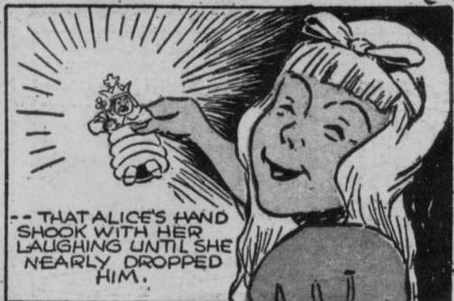
THAT ALICE'S HAND SHOOK WITH HER LAUGHING UNTIL SHE NEARLY DROPPED HIM.