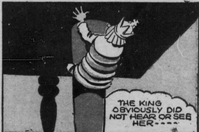
THE KING OBVIOUSLY DID NOT HEAR OR SEE HER----