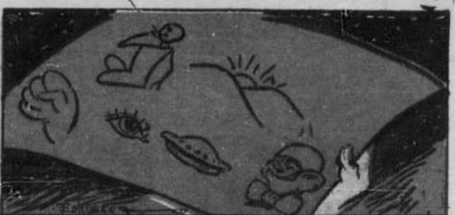
IT SAYS, KNURL EXPLAINED, "IF YOU ARE HUNGRY THIS EVENING, DON'T LOOK FOR THE BLUEBERRY PIE BECAUSE I ATE IT!"