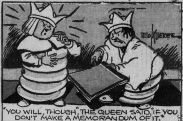
"YOU WILL, THOUGH," THE QUEEN SAID, "IF YOU DON'T MAKE A MEMORANDUM OF IT."