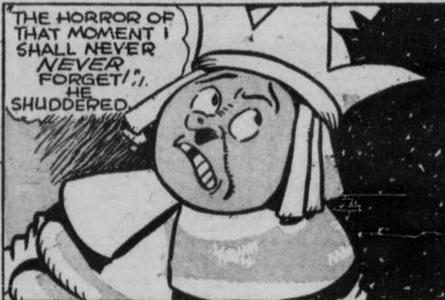
THE HORROR OF THAT MOMENT I SHALL NEVER FORGET! HE SHUDDERED.