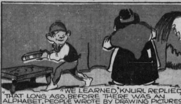
"WE LEARNED," KNURL REPLIED, "THAT LONG AGO, BEFORE THERE WAS AN ALPHABET, PEOPLE WROTE BY DRAWING PICTURES."