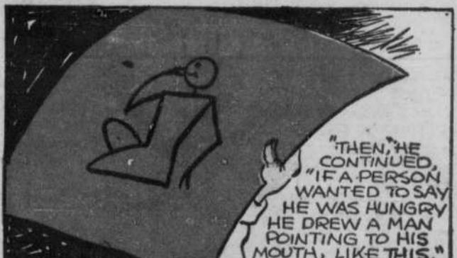
"THEN," HE CONTINUED, "IF A PERSON WANTED TO SAY HE WAS HUNGRY HE DREW A MAN POINTING TO HIS MOUTH, LIKE THIS."