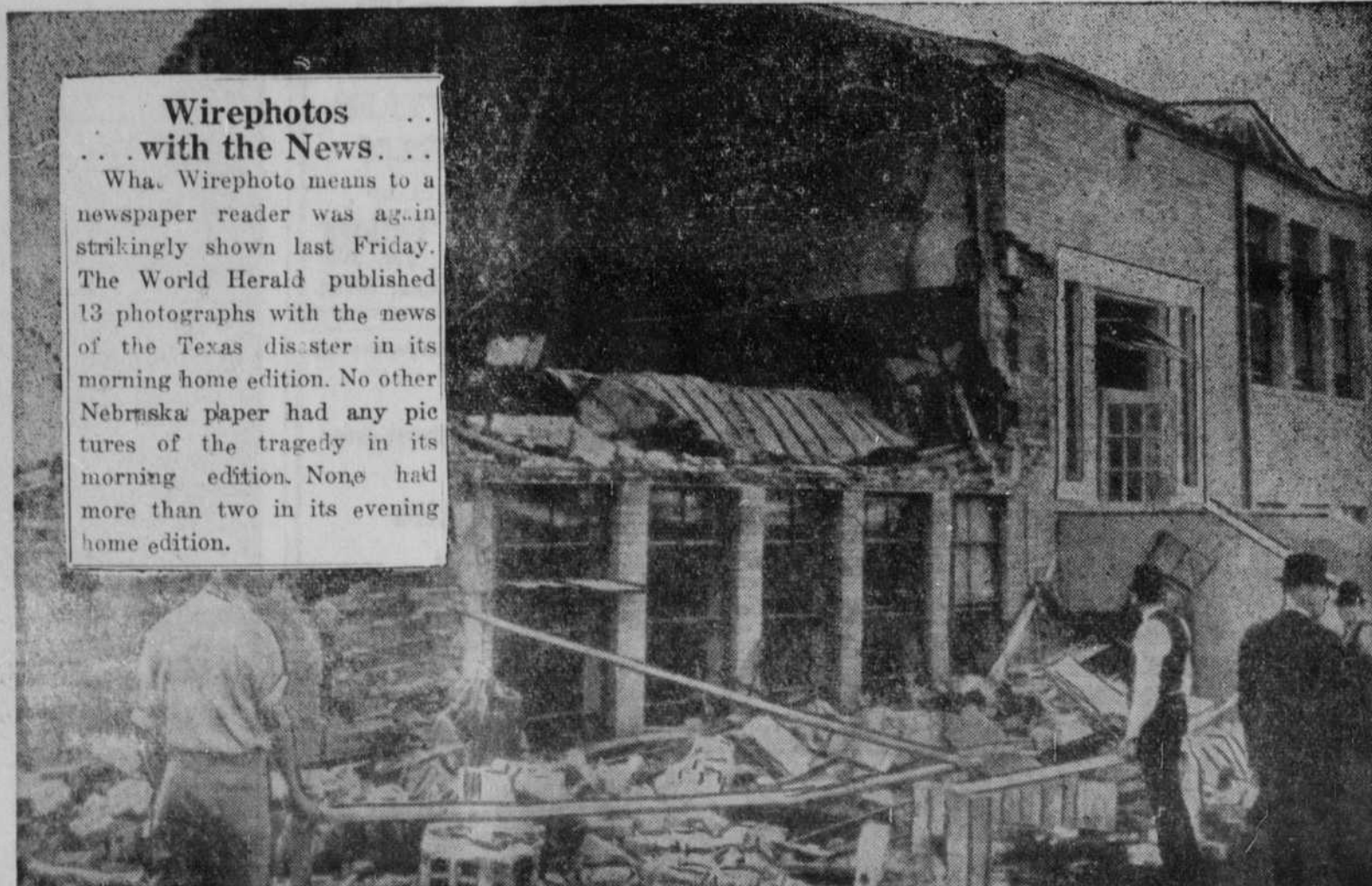
This view of a wall of the New London, Tex., consolidated school shows evidence of the fury of the blast that killed hundreds of pupils and their teachers.

Readers of The Omaha Guide you'll also find The World Herald a newspaper to your liking—complete in every sense of the word—for the whole family.