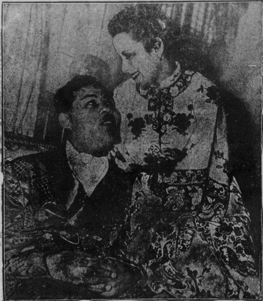
JOE LOUISES SPIKE RUMOR OF MARITAL RIFT