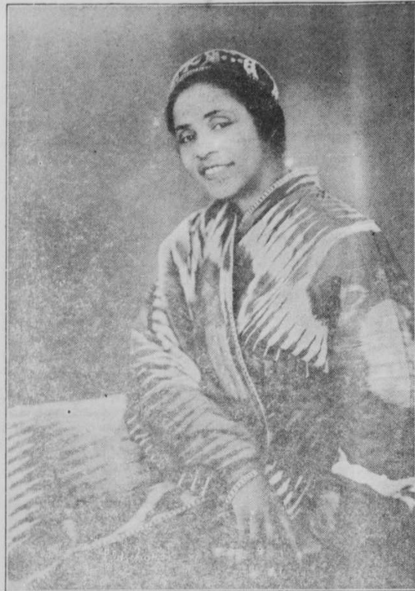
MISS THYRA J. EDWARDS

Miss Thyra Edwards, noted Chicago social worker, who remained abroad after conducting a party on an European tour, is shown here in an attractive costume worn by the natives of Utah. The cap is of needlepoint, all hand-made. The gown is of hand-woven taffeta lined with red cotton calico, and has all colors of the rainbow.