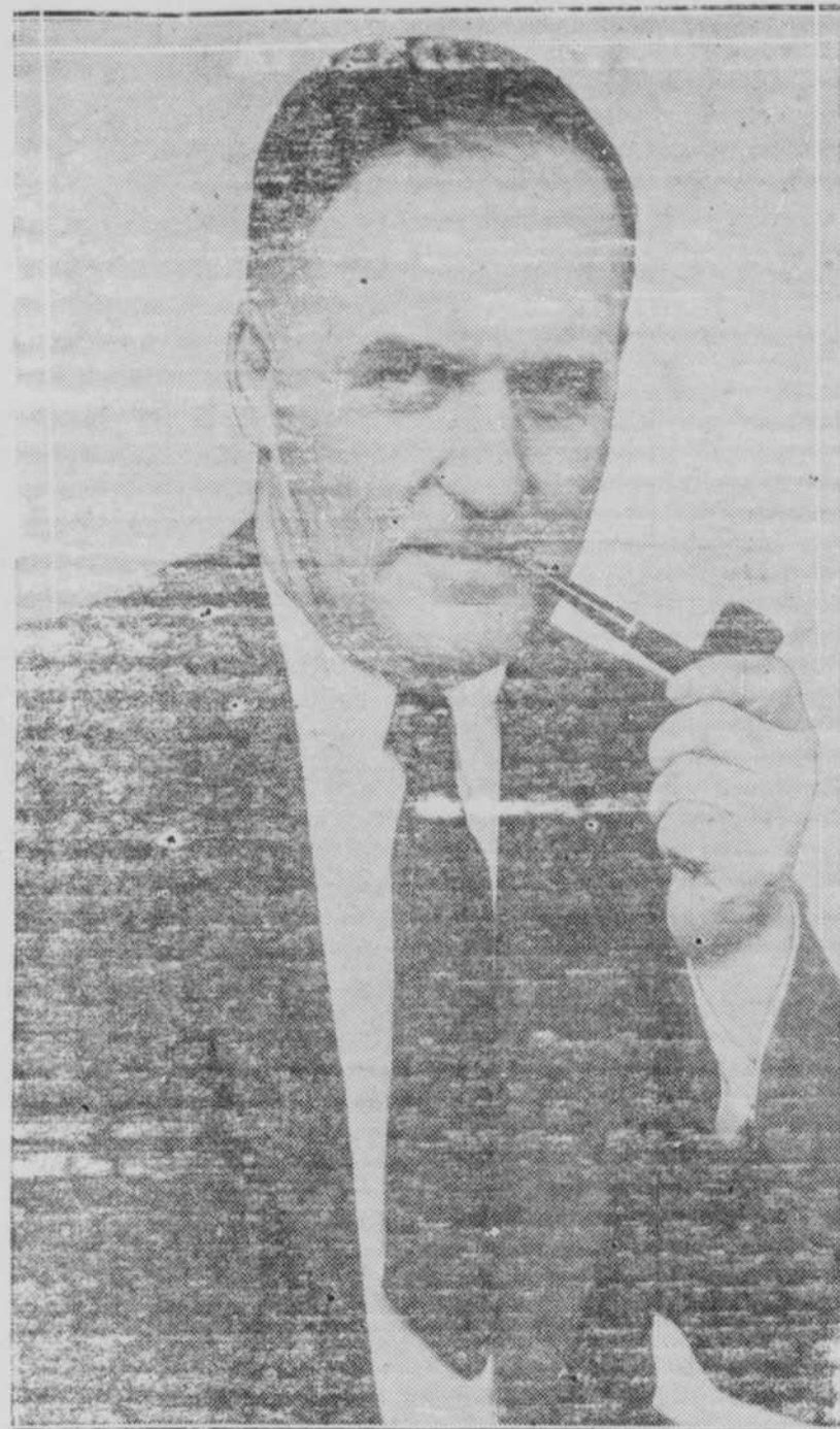
Edward R. Burke... "as kindly as the twinkle in his eyes."

Senator Burke just returned from Maine where the hot fight was in process between the democrats and republicans.