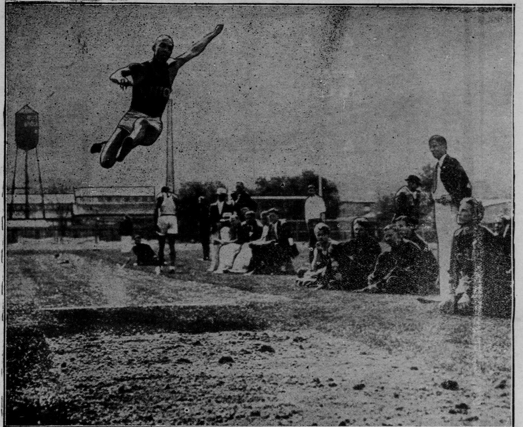
The World's Longest Broad Jump