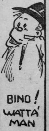
BINO! WATTA MAN