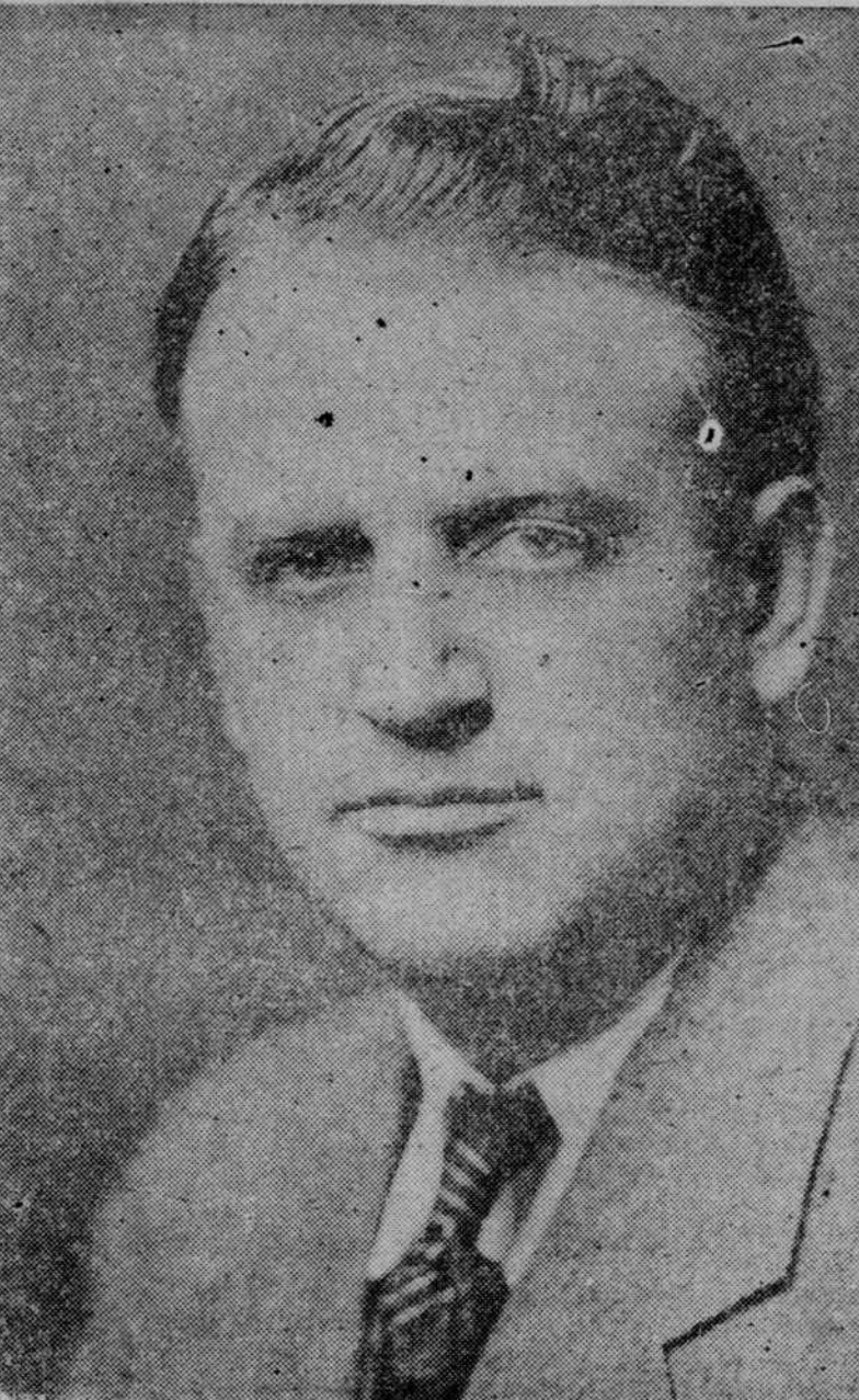
Senator Kenneth S. Wherry

Negroes have a two-fold interest in any man who places his name on the ballot for their consideration, first, their interest as an American citizen, and secondly, their interest as a Negro. Kenneth S. Wherry, candidate for the United States Senate, is a man who from his past record deserves the favorable consideration of all Negroes because he has been a fearless and courageous legislator in the Nebraska Senate and has always been on the side of the little man and the laboring man.