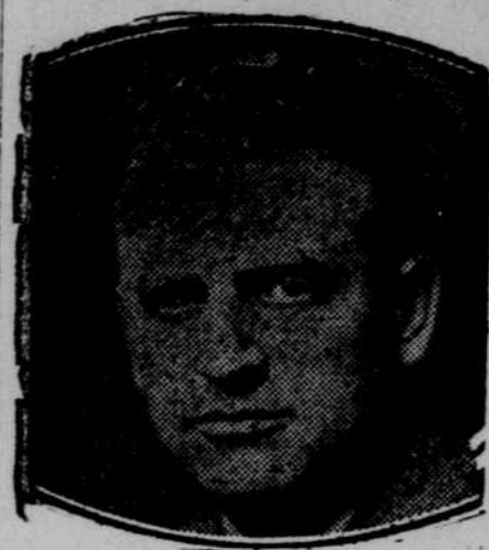
KENNETH S. WHERRY

Senator Kenneth S. Wherry, who will file as a candidate for the U. S. Senate on the Republican ticket in the primary election on August 14. Senator Wherry will announce his platform, which he is seeking to be elected on some time in the near future. Political Advertisement