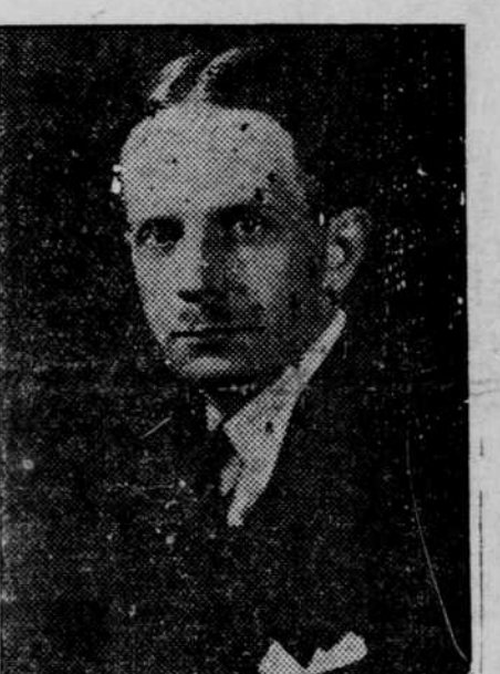
Walter White, secretary of the N. A. A. C. P., investigator of more than fifty race riots and lynchings, author of "Rope and Faggot," an exhaustive study of lynching.