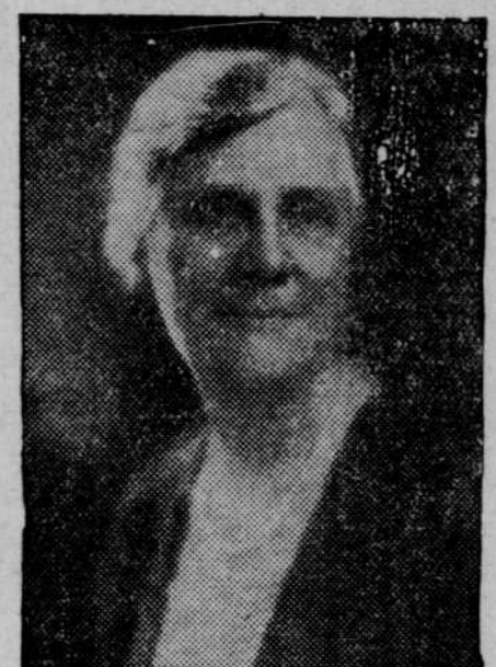
Miss Mary White Ovington, one of the founders of the N. A. A. C. P., author, lecturer, former chairman of the board of directors, and at present national treasurer.