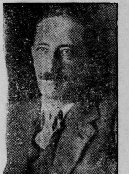
J. E. Spingarn, president of the N. A. A. C. P., donor of the Spingarn medal, awarded annually for distinguished achievements.