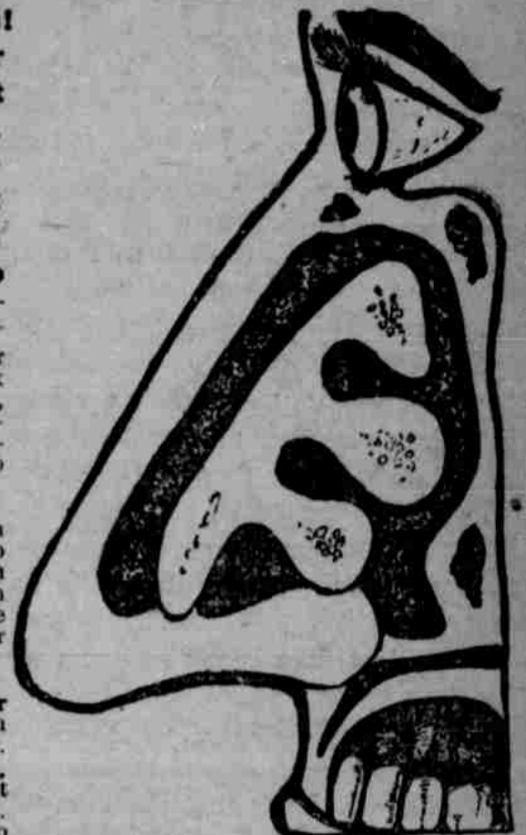
Interior of the nose showing the passages and cavities that get completely clogged with the terribly poisonous Catarrh germs.

Cure your Catarrh now! Don't neglect it another day! There's the best of help ready and waiting for you! Catarrh Specialist Sproule, the greatest authority of the age on Catarrh, is giving the most valuable and helpful