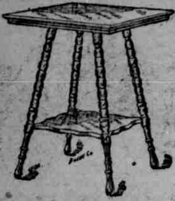
No. 219 A special value. Top measures 24x24 in., made in solid oak, finished golden, fancy turned legs, moulded top rim, solid construction, large lower shelf, and a bargain at.....$1 40