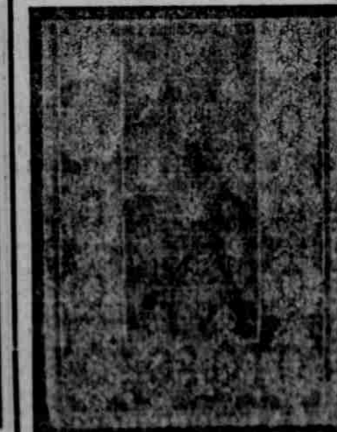
No. 2180-$1 90