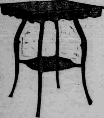
No. 223 A stylish French leg parlor table; 24x24 in. top with heavy carved rim, shaped lower shelf, patent construction, very solid, and made in quarter sawed, highly polished, golden oak or mahogany finish. Price.....$3 00 No. 224 Same stand but with 20x20 in. top in golden oak only at.....$2 75 No. 225 Same design as No. 223 but with 16x16 in. top, making a pretty odd table or window stand. Golden oak or mahogany finish.....$2 25