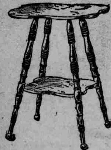
No. 222 Clover leaf table. This new style parlor table is made of solid oak, rich golden finish, and lower shelf cut to match the 24x24 in. top. Good workmanship and finish. Many stores ask $3.00. Our price .....$1 75