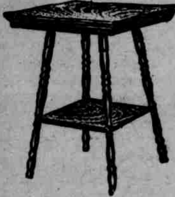
No. 220 This beautiful polished table is made of curly ash, golden finish, embossed top rim, fancy turned legs and large lower shelf; a very solid table, 24x24 in. top. Price.....$1 75 No. 221 16x16 in. top..... 1 25