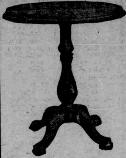
No. 340 A colonial design of great beauty. Four shaped and hand carved claw feet support the richly carved pedestal. The 28x28 in. top has the roll edge rim. An unusual and very handsome parlor piece. Made of fine figured quarter sawed oak, golden finished or in genuine mahogany. Piano polish and finest workmanship. Price in oak.....$12 0 No. 341 Price in genuine mahogany 14 00