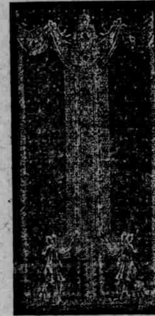
No. 6831-$2 00 each.