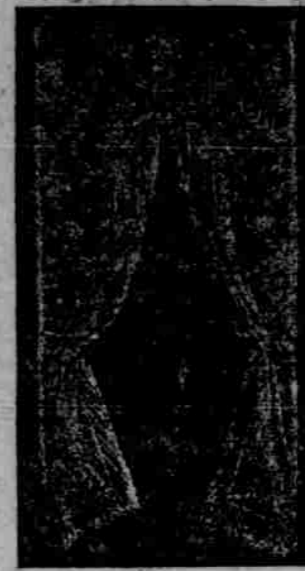
No. 4737-$1 00 each.