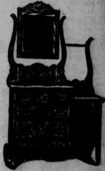
No. 496 An extra large hotel or combination dresser and washstand, three roomy drawers, the upper one with swell front, one large cupboard, all fitted with brass handles and carved mirror frame, and 18x30 bevel plate mirror. Towel frame and low base on one side for wash-bowl. Hardwood. Rich golden finish and top 20x40 in. Price.....$10 00