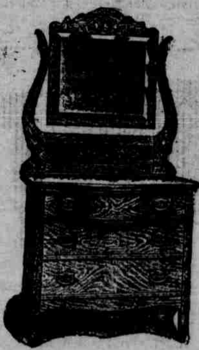
No. 491 This hardwood, well made and golden finished dresser has 20x38 in. top, 20x24 in. heavy bevel plate mirror, carved mirror frame, 1 swell top drawer, brass handles, and a challenge value.....$8 50