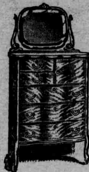
No. 488 This beautiful chiffonier has serpentine swell front, solid end panels; drawers and hat box maple lined; 18x20 in. French plate mirror, polished brass handles and locks on all drawers. Top measures 32x22 in.; high grade workmanship and hand polished finish. In quartered oak.....$23 50 Bird's-eye maple or mahogany..... 27 00