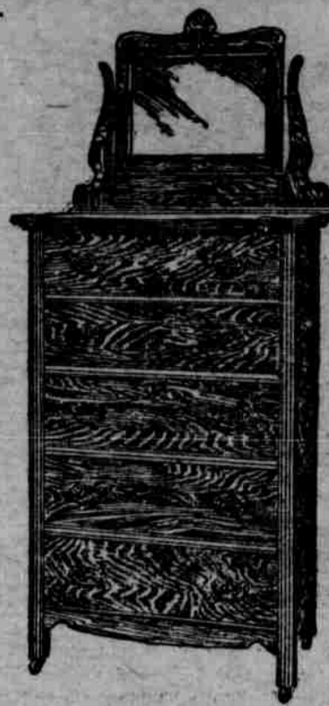
No. 476 A richly finished golden oak chiffonier; double top 20x33 in., heavy posts and side panels; all drawer sides, back, and guides are solid oak and best of workmanship; 12x18 bevel plate mirror, and complete with brass handles, locks, and casters. Chiffonier stands 68 in. high. Price.....$7 50