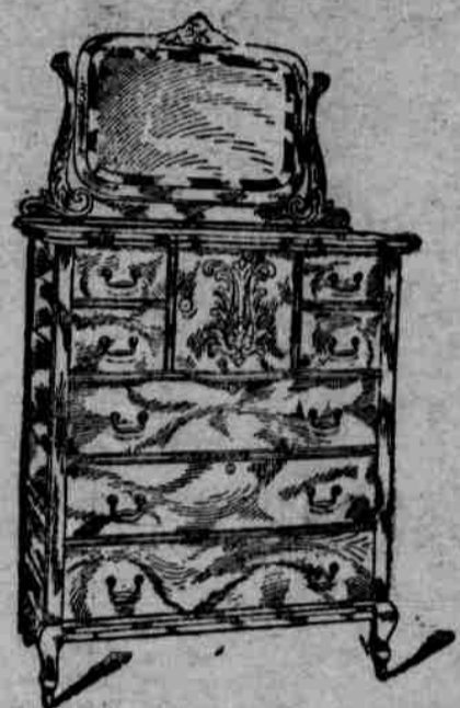
No. 482 Chiffonier. A beautiful piece of furniture and very roomy; 6 ft. high, and top measures 22x42 in., 3 big roomy drawers and 4 swell front top drawers with center hat box of quarter sawed golden oak. Carved mirror standards and French bevel plate mirror 16 x26 in. Best of workmanship, material, and finish. Price as shown.....$17 50 No. 482 1/2 Same chiffonier, but with top like No. 488 instead of mirror. Price.....$13 00