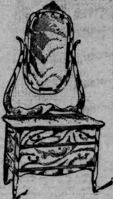
No. 539 An inexpensive, but well made Princess dresser of genuine oak throughout. The shaped double top measures 19x36 in., and the two roomy drawers are fitted with solid brass handles and good locks. One piece panel ends; carved mirror frame and 18x30 in. French bevel plate mirror. Price only.....$11 50