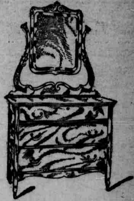
No. 493 This dresses is something that we know will please you. It is made of solid golden oak, nicely finished and neatly carved. It is 20 in. deep and 39 in. long, and has a 14x24 in. bevel plate mirror. Price.....$9 50 No. 494 Same design dresser but with 20x39 in. base and 18x24 in. shaped French plate mirror.....$10 50