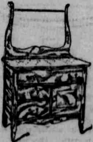
No. 514 Commode made of hardwood, best golden finish, swell top drawer, two small drawers, all brass trimmed. Top measures 19x34 in., and matches dresser. Price....$5 00