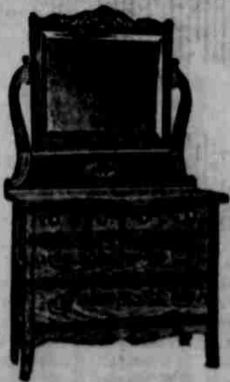
No. 496 This massive genuine oak dresser has a 21x44 in. top and 24x30 in. French bevel mirror, swell top drawers, cast brass handles, nicely carved and in rich golden finish.....$12 00