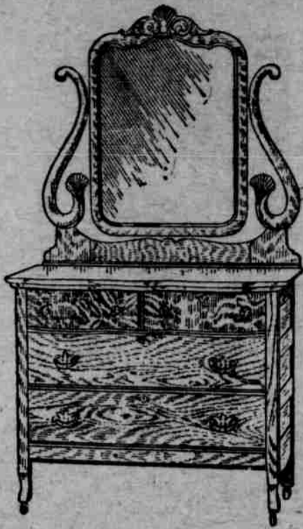
No. 57 This handsome dresser has new style hand carved mirror frame and shaped 22x23 French bevel plate mirror. The shaped double top measures 21x42 in. and two top drawers have shaped swell fronts; good locks, castors, brass handles. As shown, made of hardwood and rich golden oak finish. Price.....$14 00 No. 518 Same dresser but in polished golden oak.....$17 50 No. 519 Same dresser as No. 518 but with entire full swell front of quarter sawed and polished golden oak.....$19 00