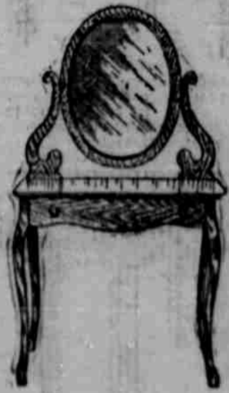
No. 515 Same commode in solid oak but designed to match oak dresser.....$6 00 No. 544 A very attractive pattern 18x32 in. shaped top; 18x24 French plate mirror; serpentine shaped drawer, French shaped legs, and all beautifully polished. In golden quartered oak or fine birch mahogany finish.....$12 00 In choice bird's-eye maple..... 14 00