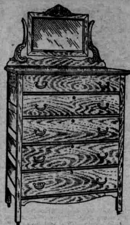
No. 478 An extra wide, all solid golden oak chiffonier; extra large, roomy, well made and finished; 5 big spacious drawers, 21x40 in. top, 12x20 in. bevel French plate mirror.....$12 00 No. 479 Same case but with carved back instead of mirror. Price.....$9 00

No. 533 Princess dressing table. The top measure 22x36 in. Full swell front base, solid one piece ends; both drawers varnished inside and fitted with locks, solid brass handles, daintily carved base, French shaped legs and mirror standards. The shaped French plate mirror measures 40x18 in. and this case combines a dresser, dressing table, and cheval glass. In richly polished quarter sawed oak golden finish. Price.....$25 00 In richly figured and polished mahogany veneer, or in bird's-eye maple. Price.....$27 00