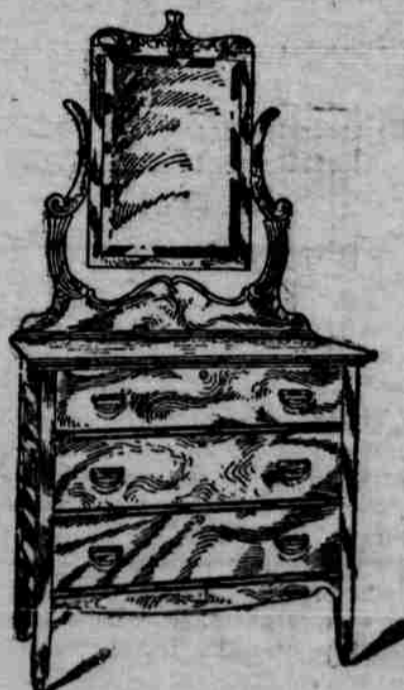
No. 495 Solid oak dresser, rich golden finish. The shaped top measures 20x42 in. and full swell top drawer; 20x24 in. shaped bevel, French plate mirror supported by richly carved standards. Excellent construction and solid oak drawer work. Complete.....$13 00