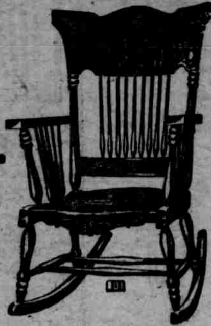
No. 113 This solid golden oak rocker, is well made, large and strong, has patent built up seat shaped just right for comfort is well braced and finished, Price.....$3.00