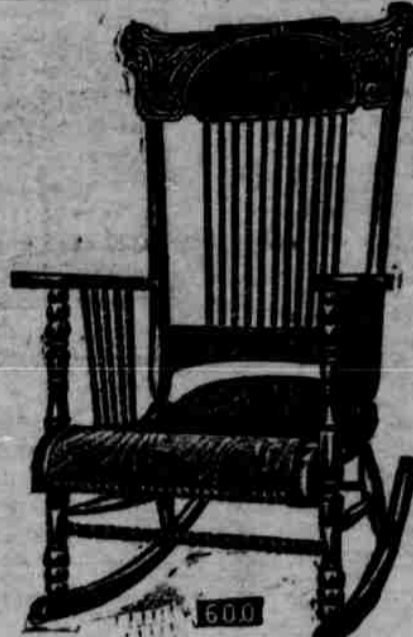
No. 114 A gentleman's large rocker, heavy rope twist spindles and embossed back panels, deep roomy seat and very comfortable, golden oak, a big value at.....$3.50