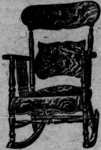
No. 130 Quarter sawed and polished golden oak rocker; continuous front posts; bolt construction, guaranteed built up roll seat; a most comfortable and stylish rocker.....$4.50