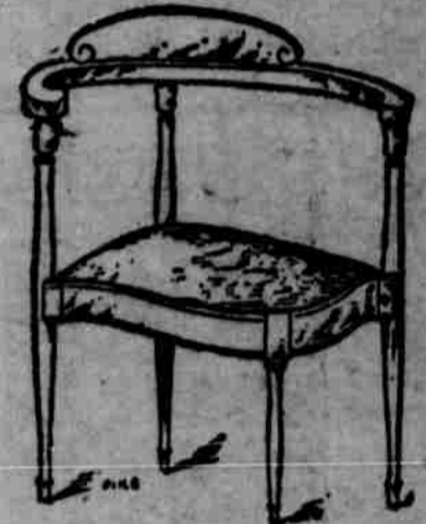
No. 801 Odd parlor piece or corner chair, golden finish, solid oak, curved back, and upholstered in damask or fancy velours. A special price of...$3.00