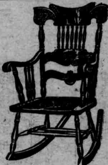
No. 125 Our special $5.00 rocker; polished quarter sawed golden oak. Saddle wood seat, gracefully shaped arms, fancy turned spindles and carved back. A good size, comfortable and very stylish rocker.....$5.00