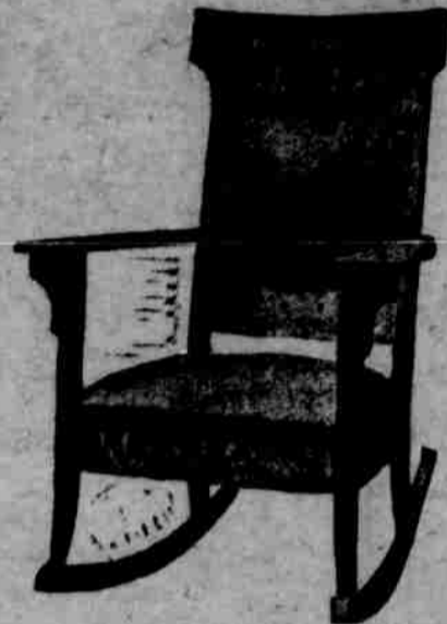
No. 137 Arm chair to match.. 12.50