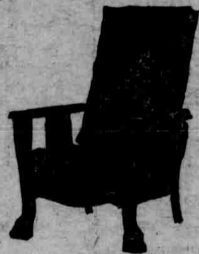
No. 815 Our best value in our new adjustable Morris chair. The massive frame is of first class workmanship, carved claw feet, curved back, patent detachable hinge attachment, and brass safety ratchet rod support. Choice quartered polished golden oak or waxed finish. Loose reversible hair filled cushions covered in choice velour or tapestry, and seat supported by tempered steel springs, thereby securing a luxuriance of comfort not obtained in any other chair. Price.....$10.00 Weathered oak to order.