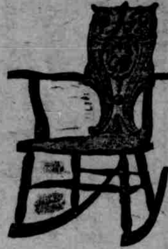
No. 136 A good size, comfortable and richly carved parlor rocker. The back is one elaborate hand carved panel. The design copied from a 16th century Italian chair. Spindles and posts are hand turned, gracefully shaped arms, wood seat, waxed oak or mahogany finish. Price....$12.50