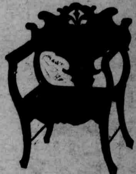
No. 802 Fancy Roman chair, shaped seat, roll arms and richly ornamented back. A comfortable, stylish fancy piece for the parlor, mahogany finish and upholstered in damask. Price.....$5.00