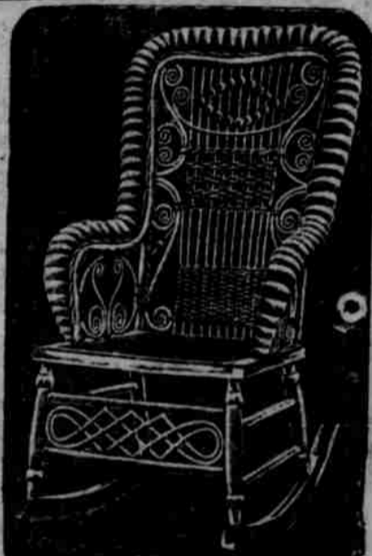
No. 12 Ladies' comfortable rocker, heavy roll arm and edge, fancy woven back, light and strong, shellac finish. Price.....$4.50