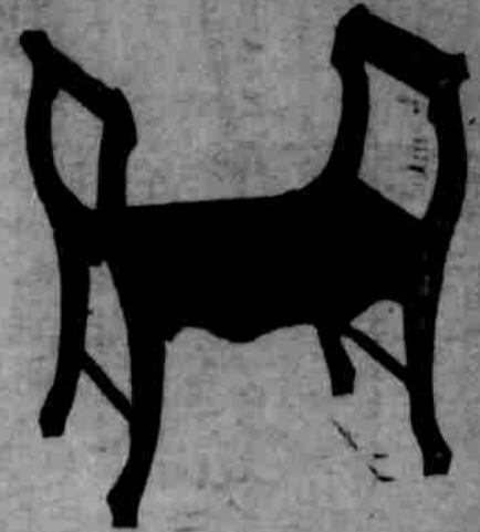
No. 800 Mahogany finish, Roman chair, graceful in design, well made and finished and upholstered in fine velours or damask. A pretty, inexpensive piece of parlor furniture. Our special Price.....$2.25