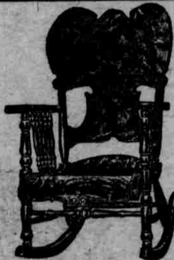
No. 131 A very large, high back, easy rocker, deep roomy seat, continuous front posts, shaped arms; quartered and polished golden oak. Price.....$5.50