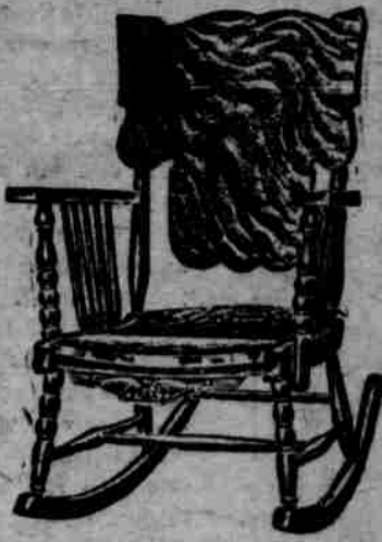
No. 129 New broad, panel back rocker; quarter sawed and polished golden oak; braced arms and fine turned spindles; a large, comfortable, and very durable rocker; one of our very best values at.....$3.75