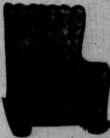
No. 816 This rocker is made to give a lifetime of perfect service. All cushions, as well as arm sides and rest, are of extra quality long, curled horse hair drawings, supported with our finest quality tempered steel springs in seat and back, and covered with our finest machine buffed leather. Choice of olive green or maroon color leather. Olive green will be supplied unless instructions to the contrary are received. The exposed wood parts solid oak. Width 28 inches; height 41 inches. Price....$27.00