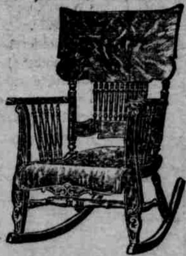
No. 135 Gentlemen's easy rocker, has a deep comfortable roll seat and a broad panel back of quarter sawed polished oak, long front posts, broad arms, neatly carved, and guaranteed to please. Price only.....$6.00