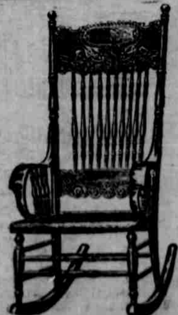
No. 112 A large rocker for family use, high back and arms, solid and massive; is a new design, made of hard wood, finished in imitation oak; has long posts and shaped wood seat. Price.....$3.25