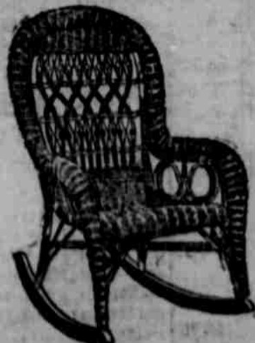
No. 23 Large, solid comfort arm rocker, shellac finish, a rocker that will suit anybody has a nice, heavy roll and is braced in the manner that all of our rattan rockers are braced, so it will not get squeaky, and will last a lifetime. Only.....$4.25