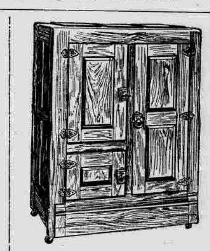
We have a line of refrigerators from 6.50 up. Call and see the two best makes on the market. The Mc-Cray and the Viking.