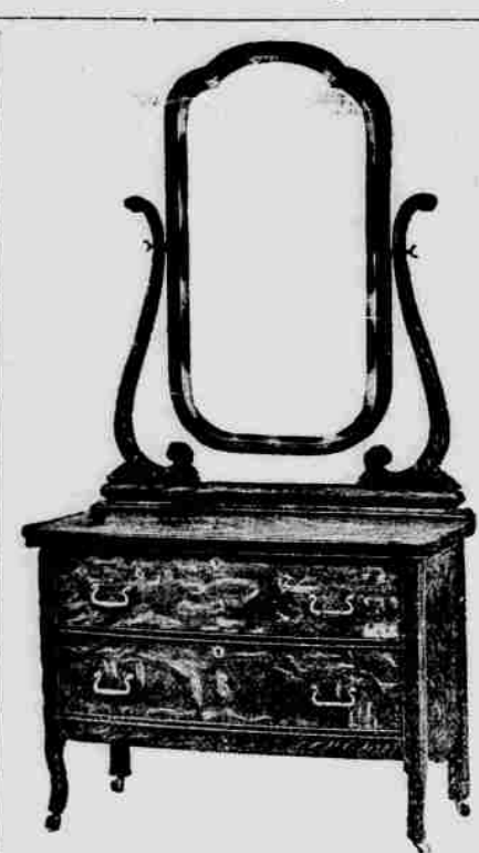
Princes Dressers $10, up