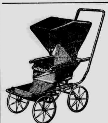
Folding Go-carts $1.45 up