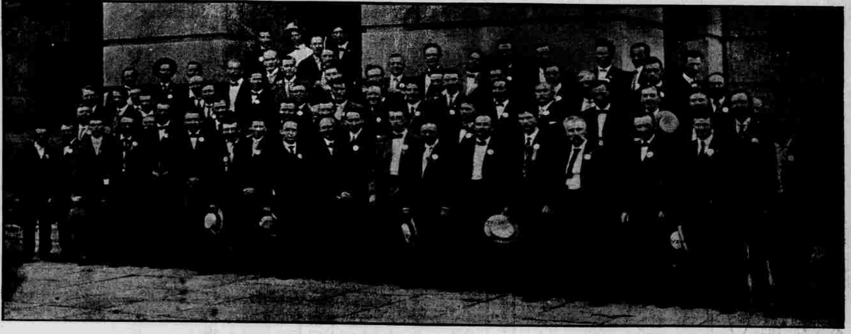
THE MEN WHO ORGANIZED THE NEBRASKA STATE FEDERATION OF LABOR

OPEN SATURDAY EVENINGS 6 to 8 F. & M. BLDG. 15th & C STREETS.