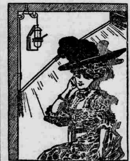
Making Artificial Sunlight.

Clear days or cloudy days and any degree of light can now be produced at will by photographers in their own