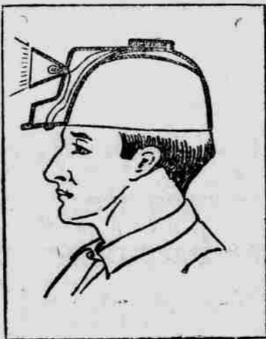
Electric Lamp in Cap.

The old-fashioned oil lamp still being used by miners seems soon to be superseded by the electrical lamp, a recent design being shown in the illustration. It can readily be imagined that the general use of the electrical lamp would mean to the miner—the elimination of the horrible accidents of daily occurrence due to explosions from contact of the oil lamp with in-