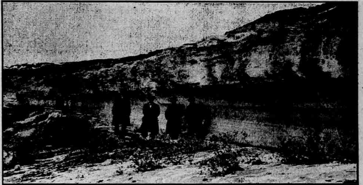
VIEW SHOWING ANOTHER SECTION OF THE SILICA MINES