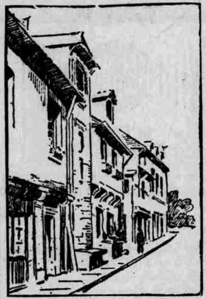
A Street in Dol.

the ancient Druids slaughtered bulls on the top of Mount Dol and bathed their prostrate worshippers in their blood, can afford to rest on its historic laurels.