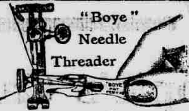
Simple, durable, automatic. It threads any needle itself even in the dark. Most valuable of all attachments. No twisting, biting or cutting thread.