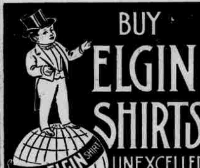
Union Made, The Best Made, Take No Other Made by CUTLER & CROSSETTE, Chicago

2011 O ST., LINCOLN, NEB. Auto 4598 Bell F562