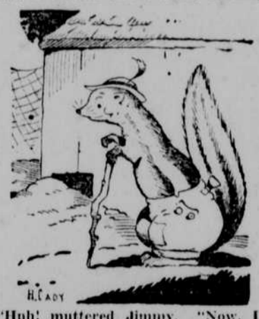
"Huh!" muttered Jimmy. "Now, I wonder who did this."

Mrs. Skunk Moves. Mrs. Skunk had talked of moving, but Jimmy Skunk hadn't paid much heed to what she said. He was too much concerned with his own immediate affairs to be particularly interested in Mrs. Jimmy's talk. There is much to do and much to see in early