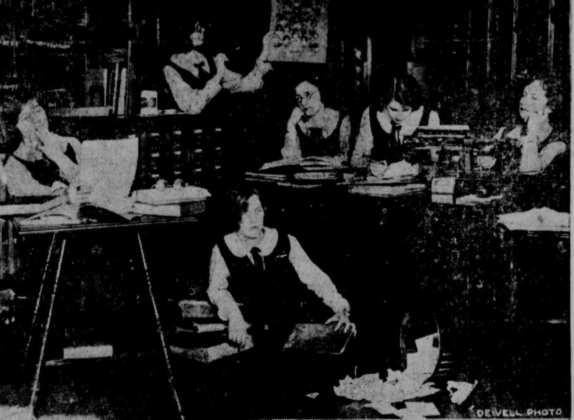
"The Gleaner" editorial staff at Mount St. Mary Seminary, went to press last week. Members of the editorial staff are shown above enjoying a few moments' relaxation after finishing their work.