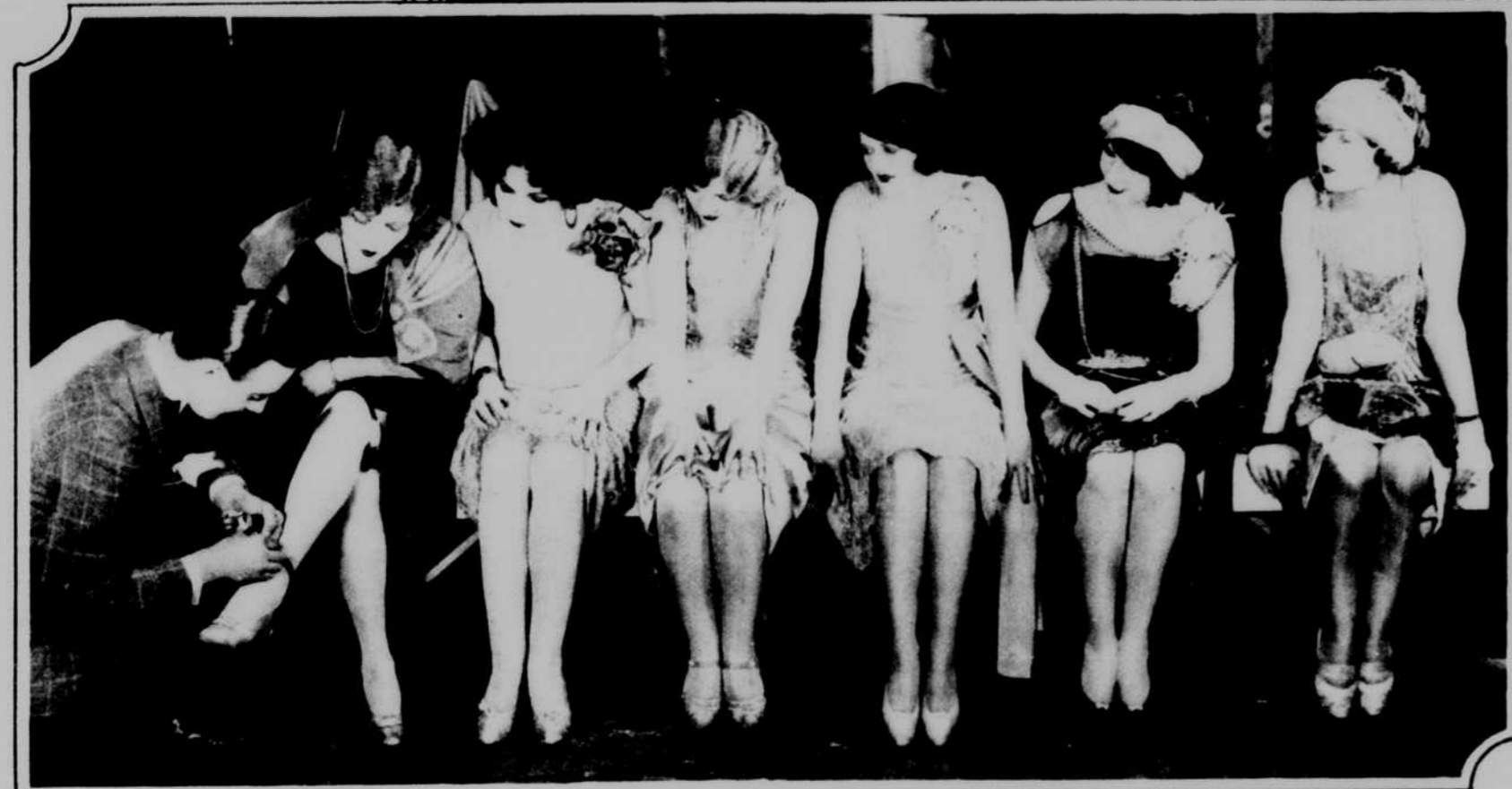
Georgian Prince selects shapeliest limbs in cast of new picture. Prince Serge M divani, scion of a dethroned King of Georgia, now a Republic, acted as the judge in a contest to decide which of the cast of a new screen production had the shapeliest limbs.

VICKS VAPORUB More than 17 Million Jars Used Yearly