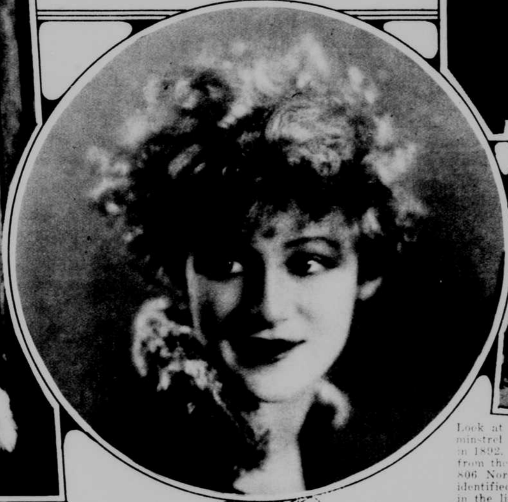
She's said to be the most promising screen discovery in years, Greta Nissen, who has been signed to a long-term contract by Famous Players-Lasky. She first attracted the attention of Jesse Lasky by her dance in the pantomime in "Beggar on Horseback." Now she's headed toward stardom in the films.