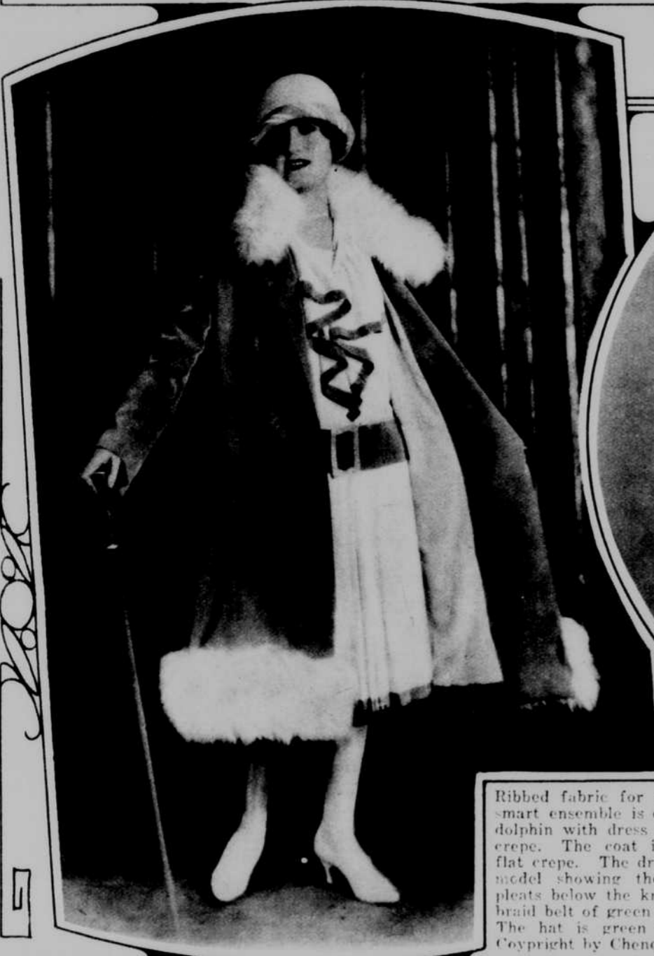
Ribbed fabric for spring. This smart ensemble is of green cote dolphin with dress made of flat crepe. The coat is lined with flat crepe. The dress is a sport model showing the new front pleats below the knee, and with braided belt of green cote dolphin. The hat is green white straw.