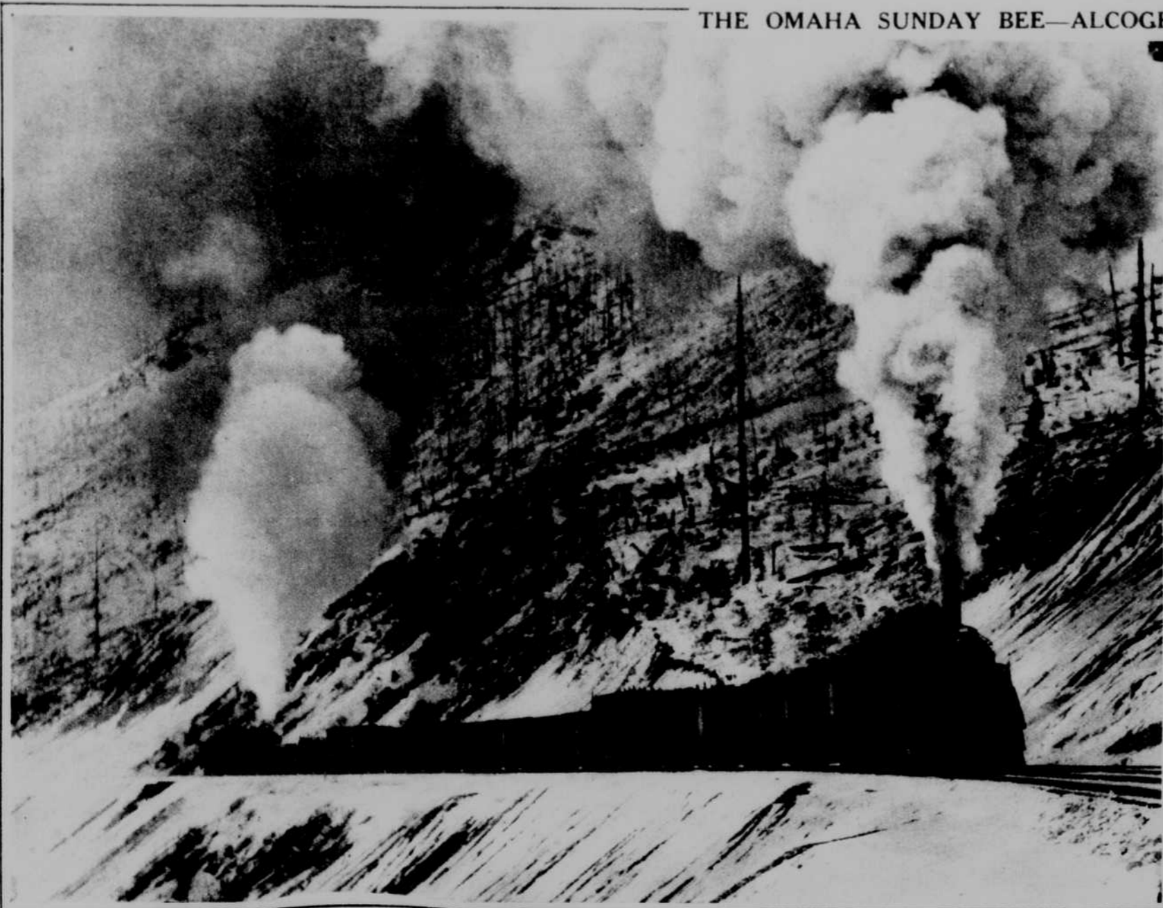
Railroading through the mountains in winter is no light task. Even on so short a freight train as this the Great Northern has to double-head through Glacier National park.