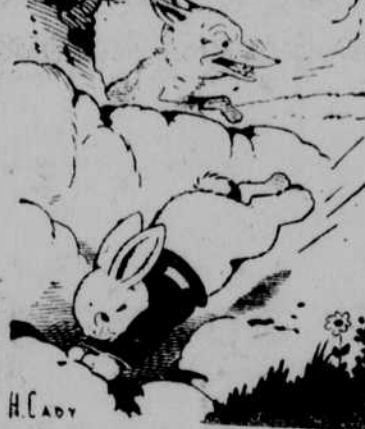
He bounded forward and dived head first down into the long hall of Johnny Chuck's house.

But Peter didn't hesitate. His wits worked fast. They told him that there was just one way and only one way of escape open to him and that was Johnny Chuck's house. Never had he been in there. He hadn't expected ever to go in there as long as Johnny and Polly Chuck used it. They might be very angry, and Peter knew that