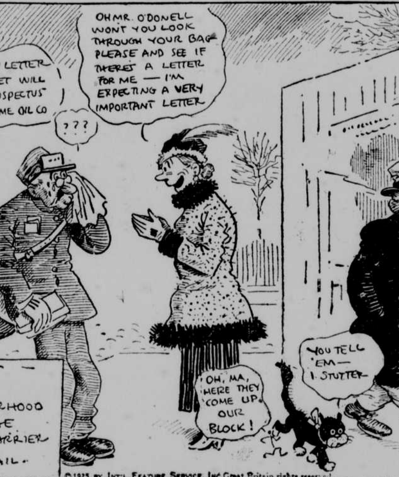
LAMPING THE NEIGHBORHOOD BET AS SHE STOPS THE OVERBURDENED LETTER CARRIER TO INQUIRE ABOUT MAIL.

A LARGE number of Omaha's vast array of amateur ball teams took advantage of the summer inclined weather of yesterday and utilized nearly all of the park diamonds and corner lots for practice purposes.