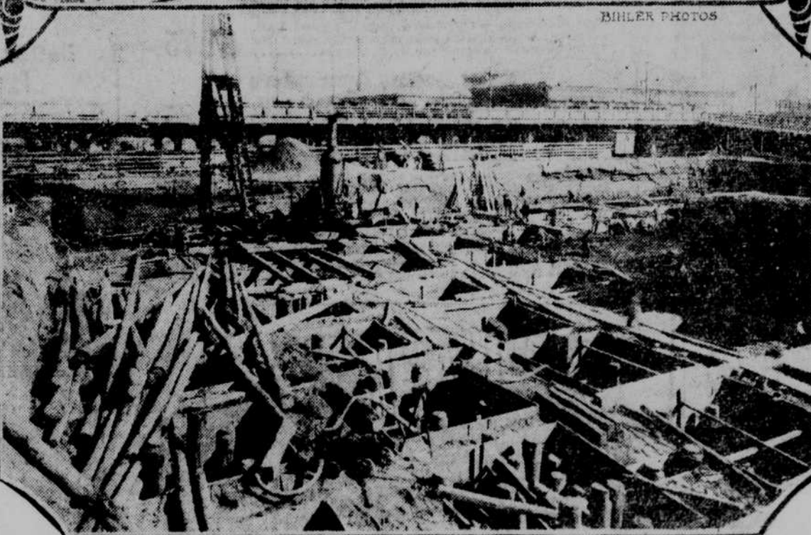
Top view is of the excavation where the new Livestock Exchange building will be erected at the South Omaha stockyards. It is estimated that 25,000 cubic yards of earth will be removed before the excavation is completed.