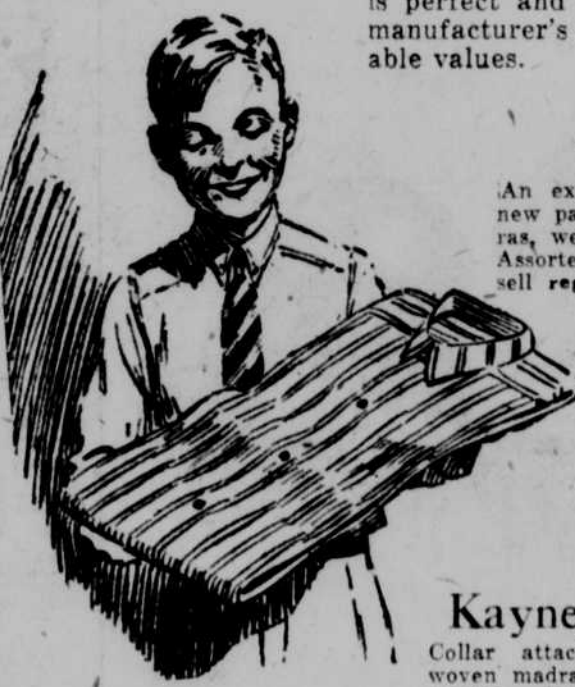
The Brandeis Store Boys Dept. Fourth Floor

Kaynee shirts and blouses are noted for excellence of workmanship and quality of material. Every one is perfect and of first quality. They represent the manufacturer's effort to co-operate, hence the remarkable values.