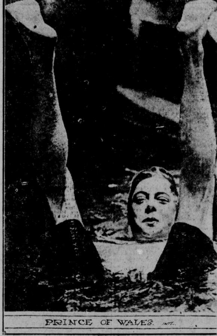
No one ever saw the prince of Wales when he took his daily dip aboard one of the ships on which he made his junkie. At least, that's what he thought, but the prince failed to notice the prying cameraman who snapped this undignified picture of the heir to Britain's throne.