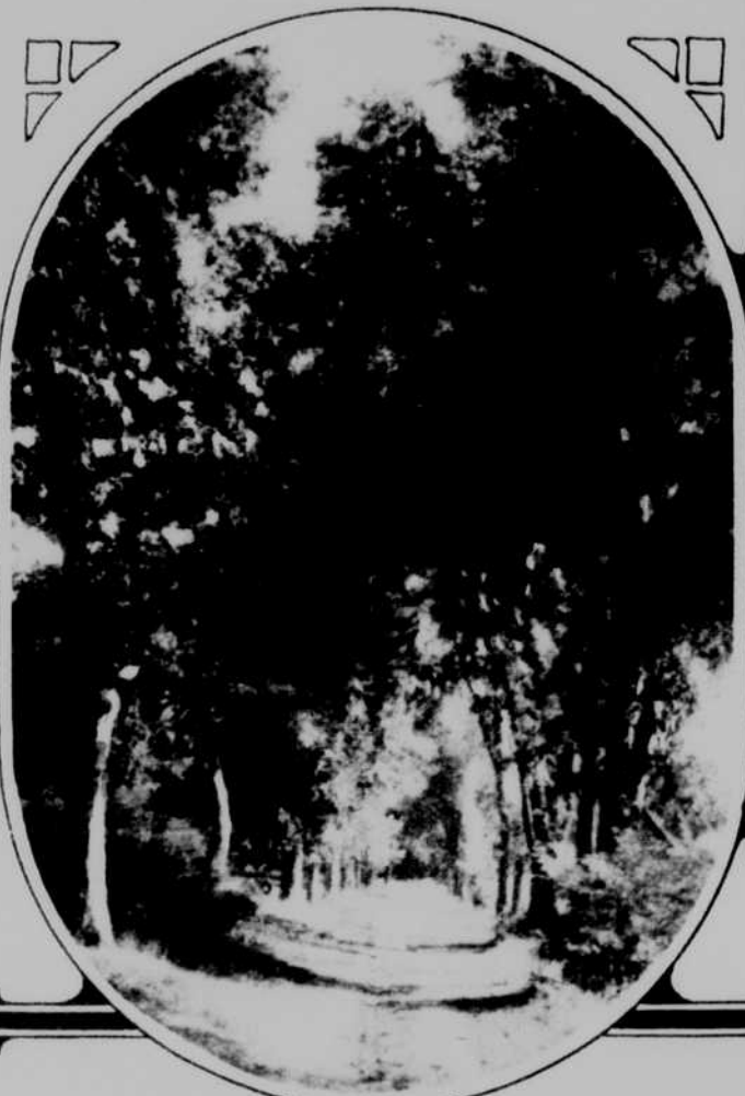
A beauty spot in a roadway leading into Nebraska City.