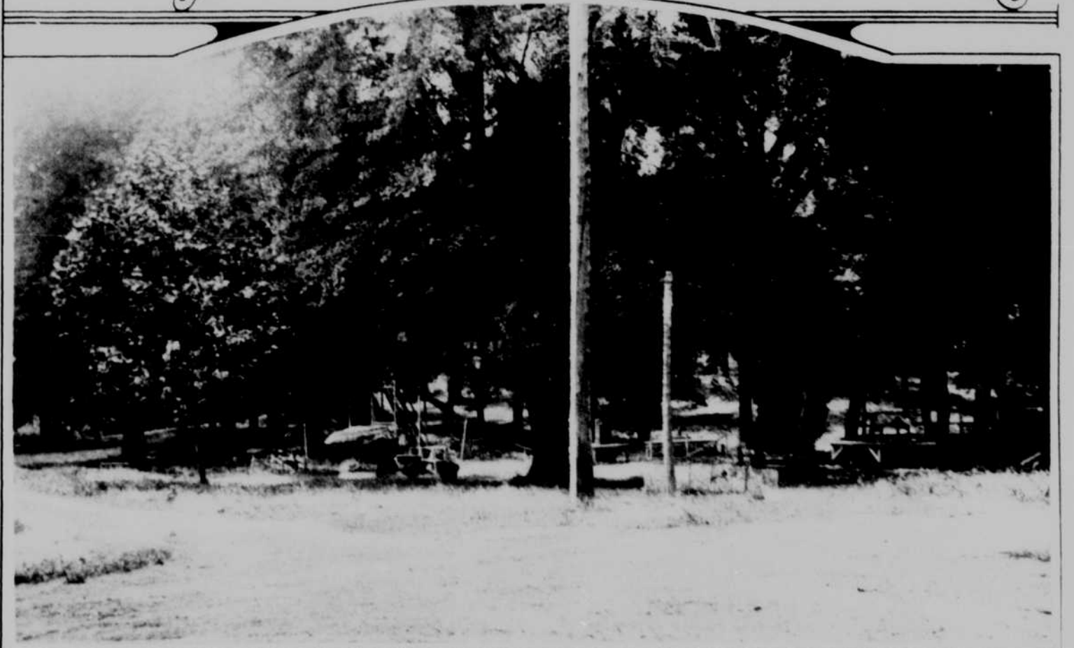
City park at Fort Calhoun, Neb., showing the Lewis and Clark monument in the foreground.