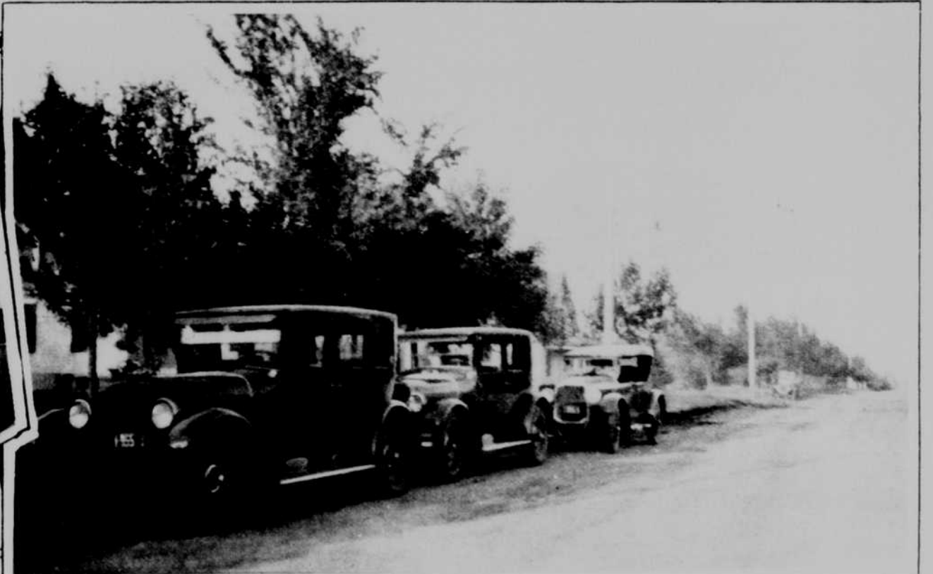
On the Meridian highway entering Crofton, Neb., from the west