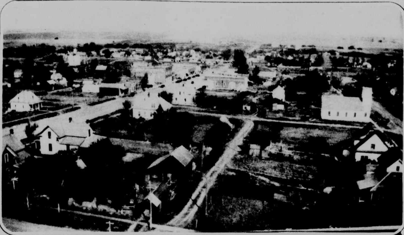
Looking down over Catpohll, Neb.