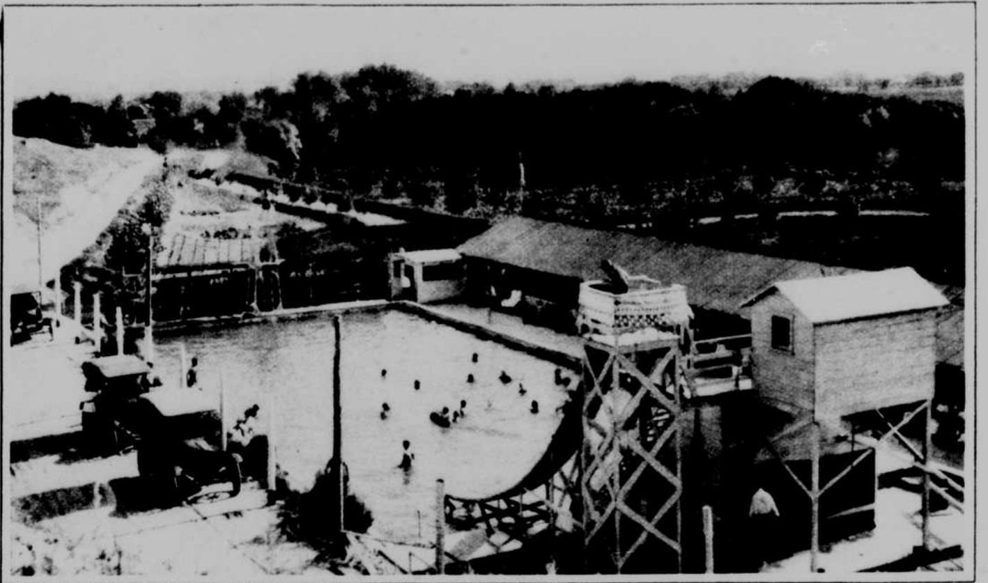
Swimming pool in Senter park at Franklin, Neb.