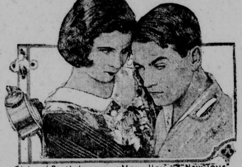
Richard Barthelme and Mary Hay in "New Toys"