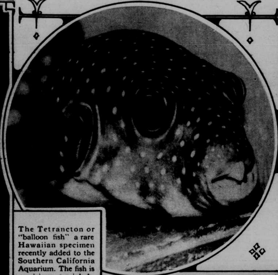
The Tetracton or "balloon fish" a rare Hawaiian specimen recently added to the Southern California Aquarium. The fish is a vicious sea inhabitant that displays its anger by swelling its body.