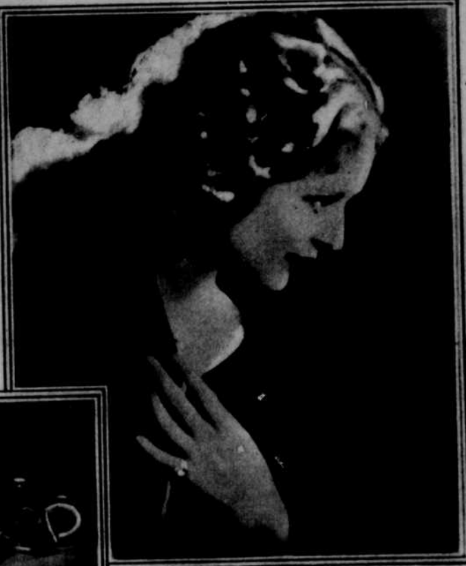
Marguerite De La Motte Popular Star of the Screen