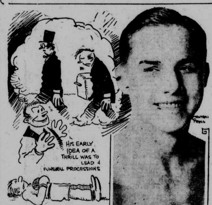
Now he lays them out in a different way.