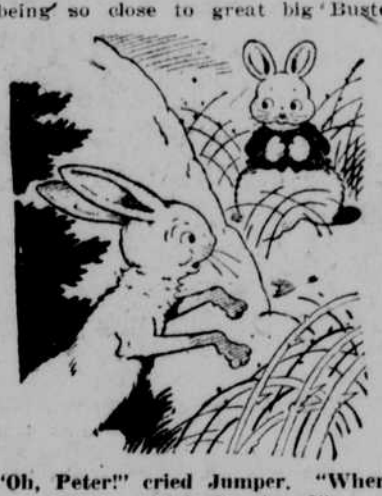
do you think I've been?"

Of course Jumper the Hare just had o stay in Buster Bear's bedroom for some time. He didn't dare go out. In the first place, he had got to rest Then, too, he didn't know where Old didn't know he had been touched. Man Coyote was. Old Man Coyote After a bit Jumper crept back. He might be waiting for him to come out. touched that big paw again, only At first Jumper's heart went pit-apat, pit-a-pat at the mere thought of Buster didn't move. After that