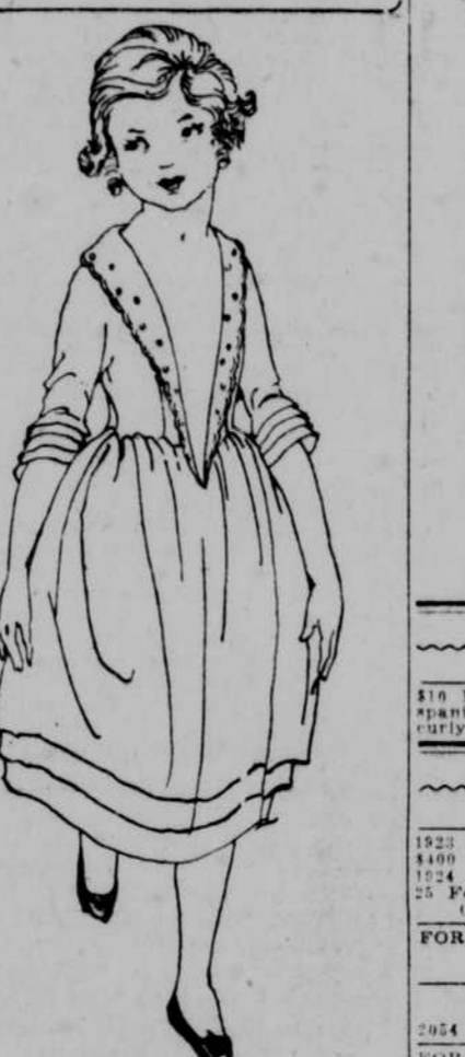
Meet Miss Jill. You all know that 'Jack and Jill went up the hill to fetch a pail of water; Jack fell down and broke his crown, and Jill came tumbling after.'

But do you know just how it all happened? Follow color cut-outs this week and you will find out the whole story. You can also cut out and color Jill and Jack and the well, and you can make a cardboard hill for them to fall down.