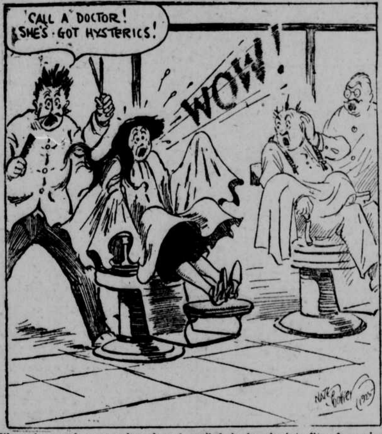
"When she sees her crowning glory despoiled she breaks into fits of weeping."

By O. O. McINTYRE. I have always thought one of the best places to study humanity was in a barber shop.